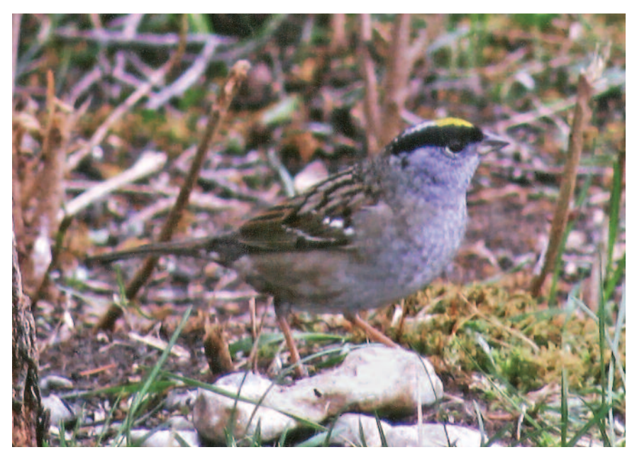
Figure 22. Golden-crowned Sparrow at West Bay, Manitoulin on 3-6 May 2010.