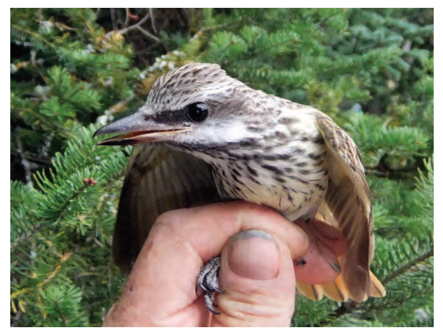
Figure 13. Ontario's third Sulphur-bellied Flycatcher, at Thunder Cape, Thunder Bay on 30 September 2010.