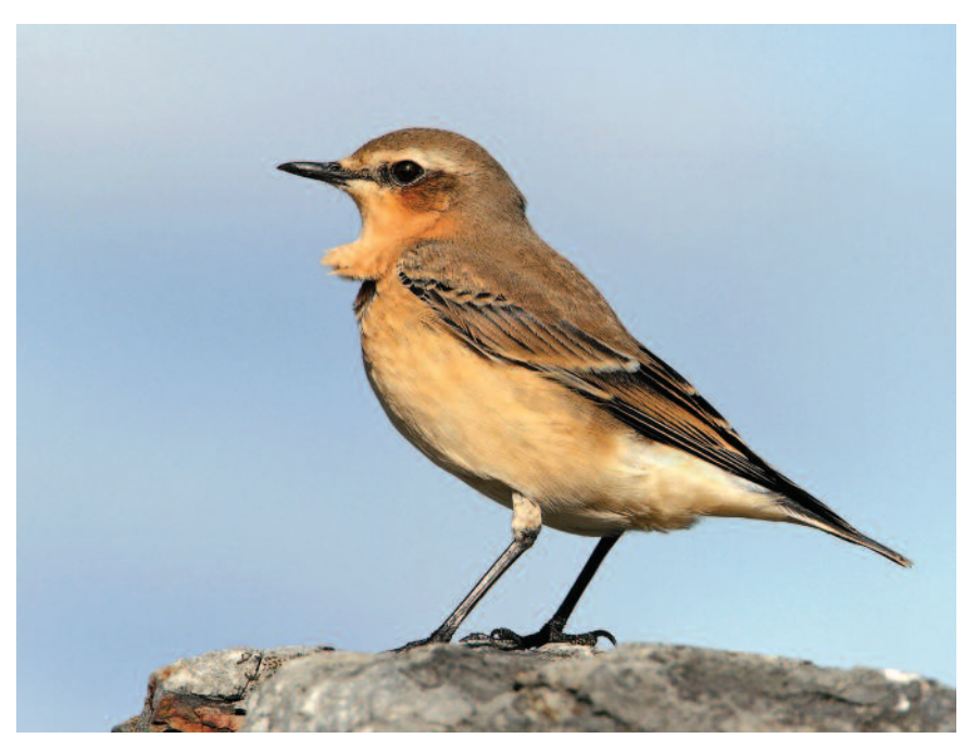
Figure 16. Northern Wheatear at Petrie Islands, Ottawa on 16 October 2010.

Figure 15. Loggerhead Shrike at Thunder Bay (Chippewa Landfill), Thunder Bay , on 3-5 May 2010. Note the brown primary feathers, indicating the bird is in first alternate plumage.