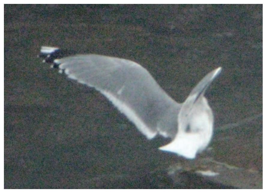
Figure 11. Adult Mew Gull (nominate canus group) at Queenston, Niagara on 6-7 January 2010. Note the diagnostic wing-tip pattern.