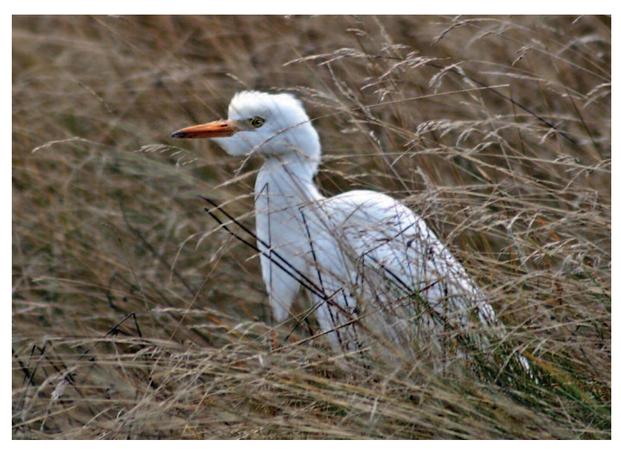
Figure 8. Cattle Egret at Wawa, Algoma on 8-12 November 2010.