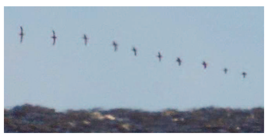
Figure 5. A composite image of the Sooty/Short-tailed Shearwater flying over the waters of southern James Bay at Netitishi Point, Cochrane, on 13 November 2010.