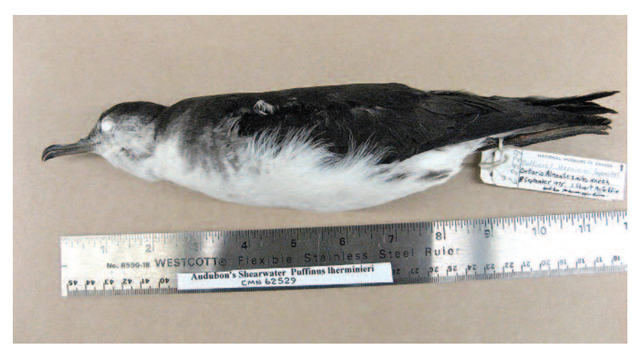
Figure 6. The Audubon's Shearwater that was found dead on 8 September 1975 at Almonte, Lanark ; the specimen resides at the Canadian Museum of Nature (Ottawa).

Although this Audubon's Shearwater is the sole record for the province, it is not new to the Checklist of Ontario Birds since it had already been listed based on this known specimen.