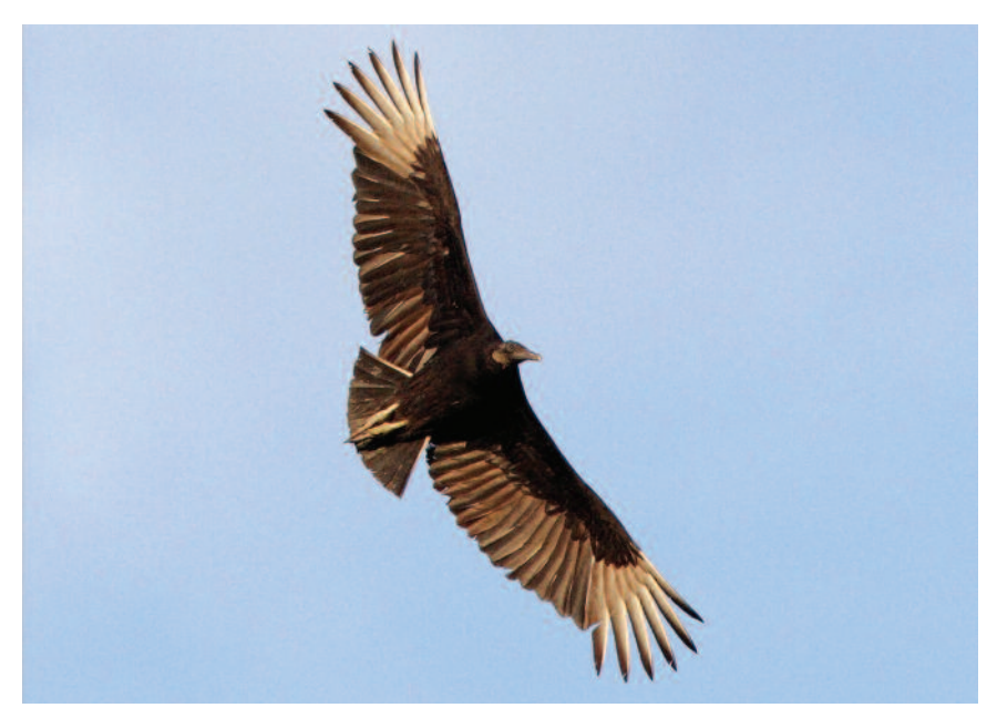
Figure 10. Black Vulture at Hamilton (Valley Inn), Hamilton on 21 April 2010.