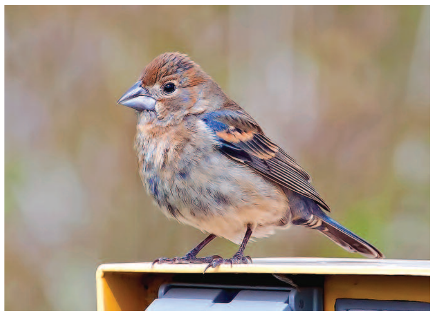
Figure 23. Female Blue Grosbeak at Rondeau Provincial Park, Chatham-Kent, on 8-15 May 2010.