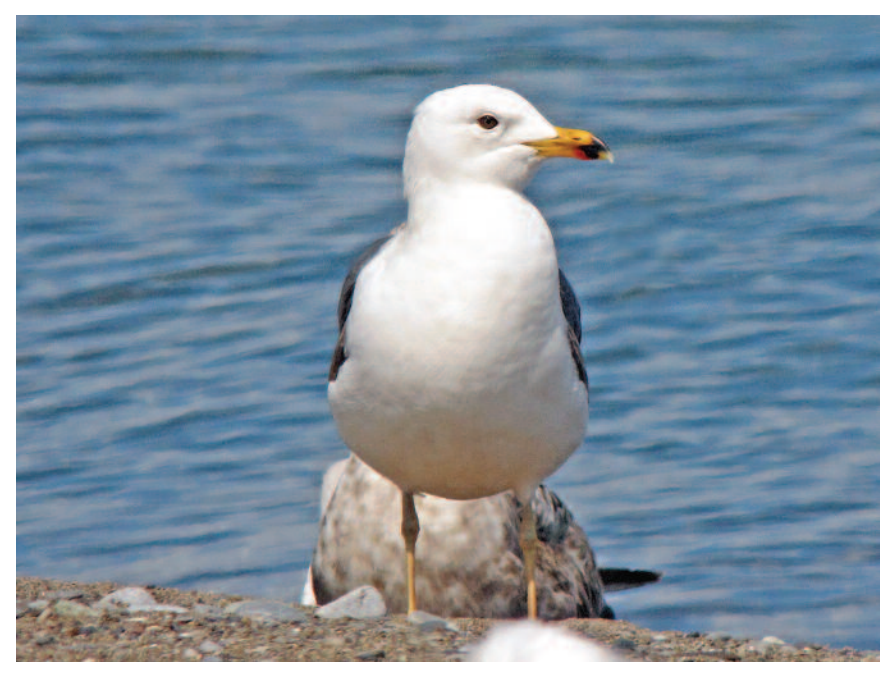
Figure 12. Third alternate California Gull at Wheatley Harbour, Chatham-Kent on 6 May 2010.