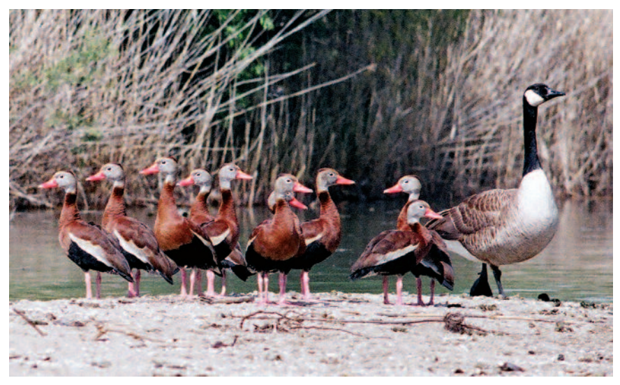
Figure 2. A flock of ten Black-bellied Whistling-Ducks at Windsor (Peche Island), Essex on 15 May 2010.

Unfortunately these birds were seen after sunset and only in flight, thus a specific identification could not be made.