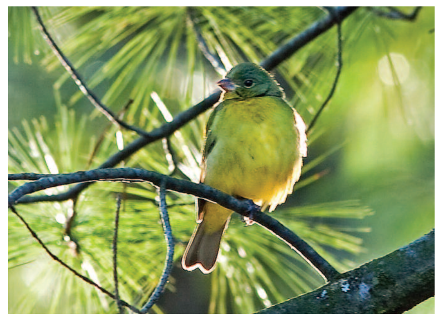
Figure 24. Painted Bunting at Miners Bay, Haliburton on 24-25 November 2010.