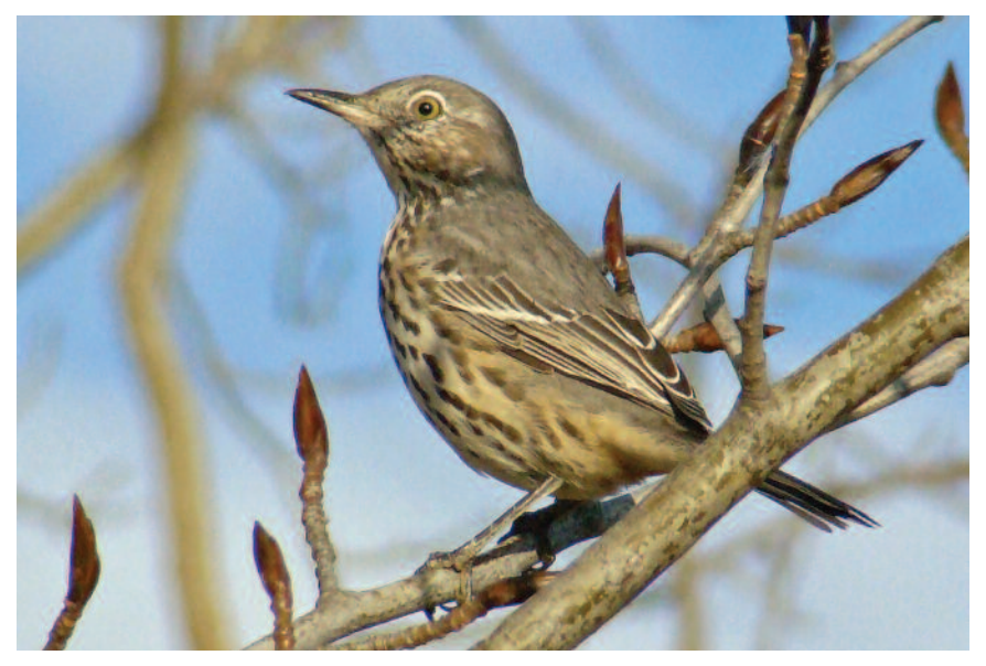
Figure 17. Sage Thrasher at Thunder Bay (Mission Island), Thunder Bay on 9 October 2010.