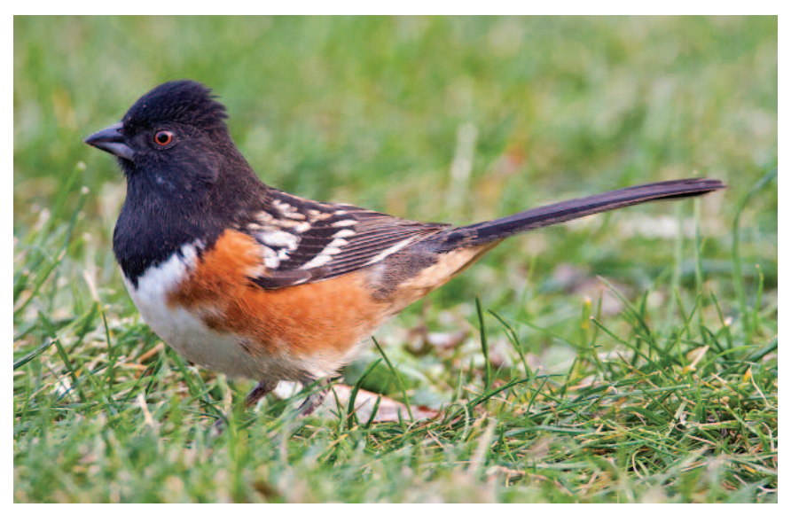
Figure 20. Male Spotted Towhee of the arcticus subspecies, at Port Rowan, Norfolk , where it was present from 13 November 2010 to 24 January 2011.