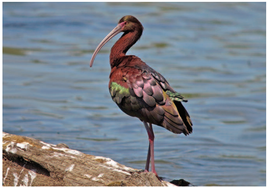
Figure 9. This immature (first alternate) White-faced Ibis remained at Big Creek Marsh, Essex from 25 April to 10 May 2010.