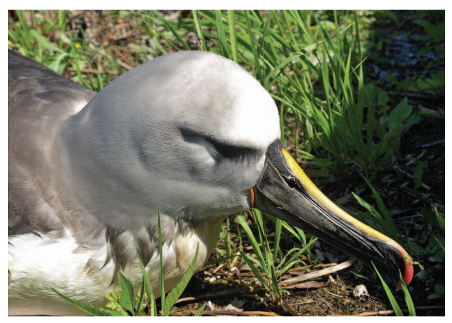
Figure 4. "Atlantic" Yellow-nosed Albatross at Wolfe Island (Browns Bay), Frontenac on 17 July 2010.

This is certainly one of the most interesting species ever to be found in Ontario. A complete account of this remarkable occurrence has been published by Martin