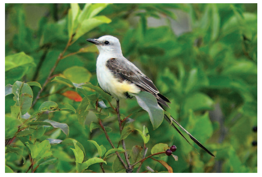
Figure 14. Adult Scissor-tailed Flycatcher at Monticello, Dufferin , that remained from 2 August to 1 September 2010.