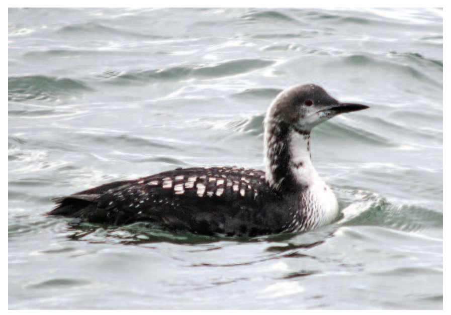
Figure 3. One of three adult Pacific Loons that were at Oshawa, Durham , during the fall of 2010; this individual was present 29 October to 9 November.