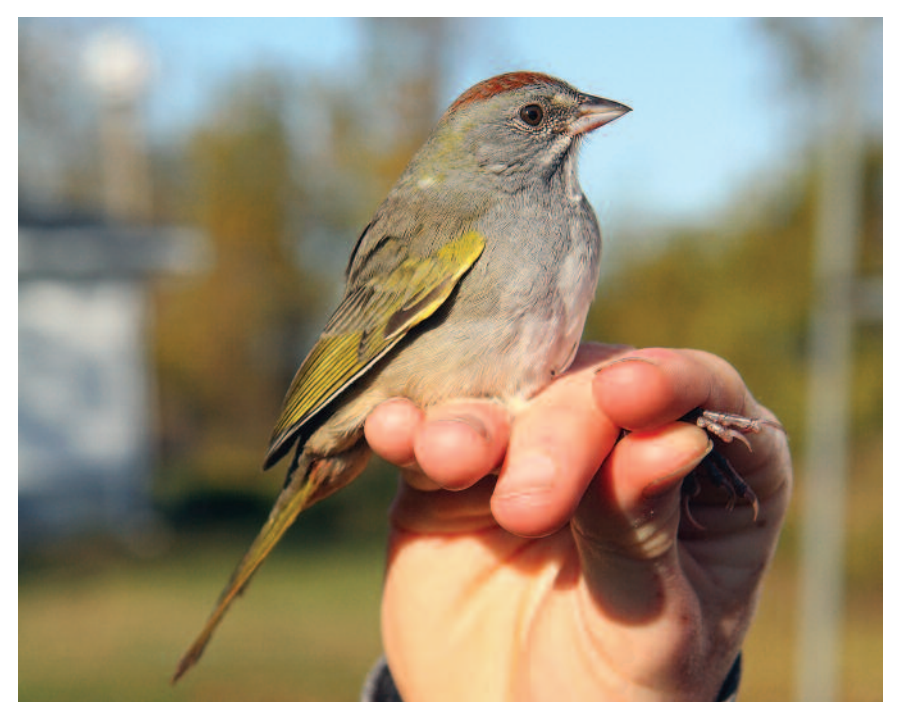
Figure 19. Green-tailed Towhee at Long Point Tip, Norfolk on 21-25 October 2010.