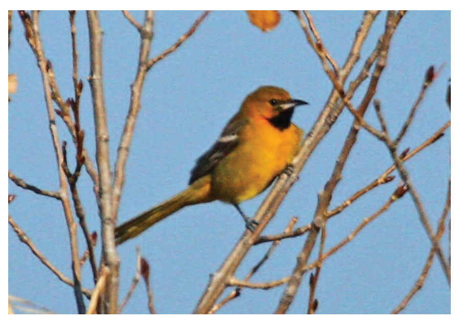
Figure 25. Immature male (first basic) Hooded Oriole at the Tip of Long Point, Norfolk , on 8 November 2010.