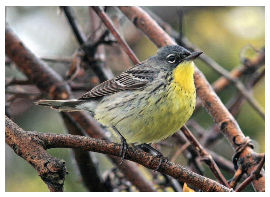
Figure 18. Kirtland's Warbler on 22-23 May 2010 at Point Pelee National Park, Essex.