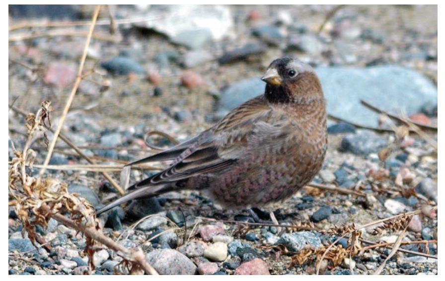
Figure 26. Gray-crowned Rosy-Finch at Marathon, Thunder Bay , where it was present from 20 December 2009 to 13 March 2010.