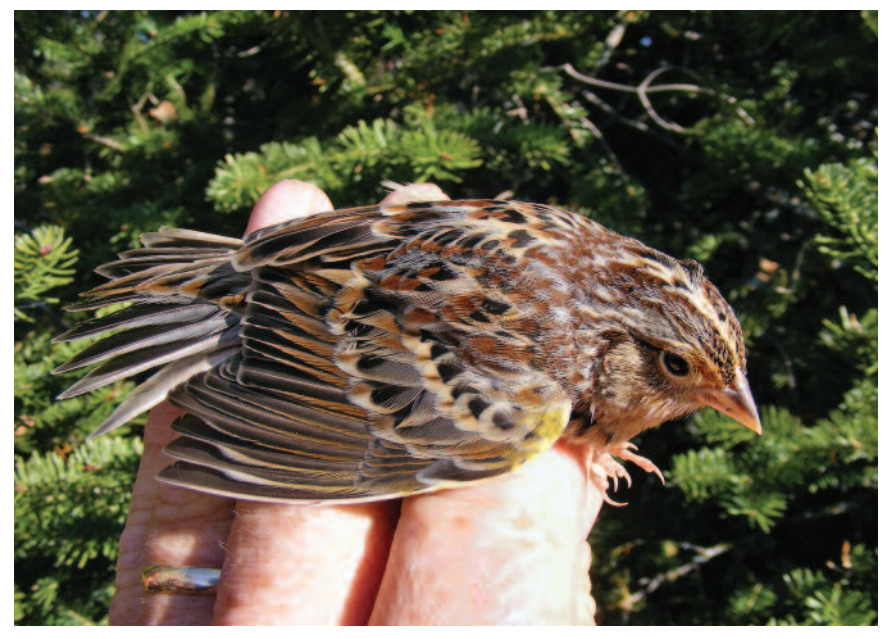
Figure 21. This Grasshopper Sparrow that was caught for banding at Thunder Cape, Thunder Bay , was present 18-21 October 2010.