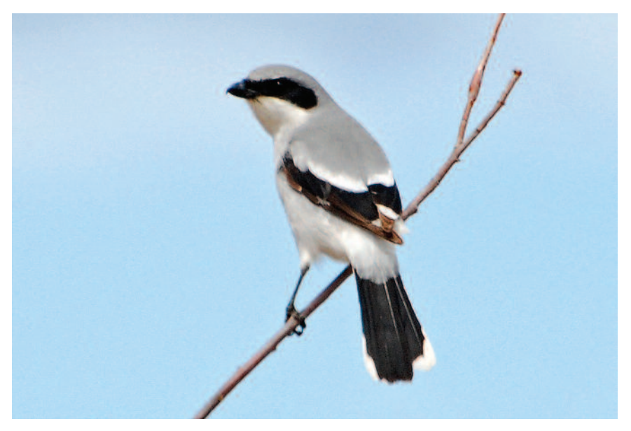
Figure 15. Loggerhead Shrike at Thunder Bay (Chippewa Landfill), Thunder Bay , on 3-5 May 2010. Note the brown primary feathers, indicating the bird is in first alternate plumage.