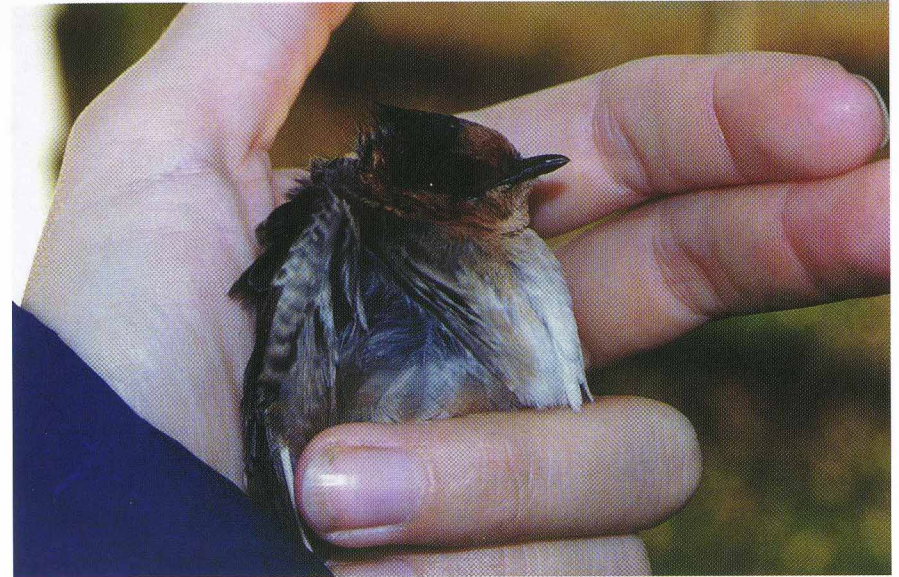
Figure 4: Juvenal Cave Swallow captured and banded at Long Point Tip on 4 November 1999.