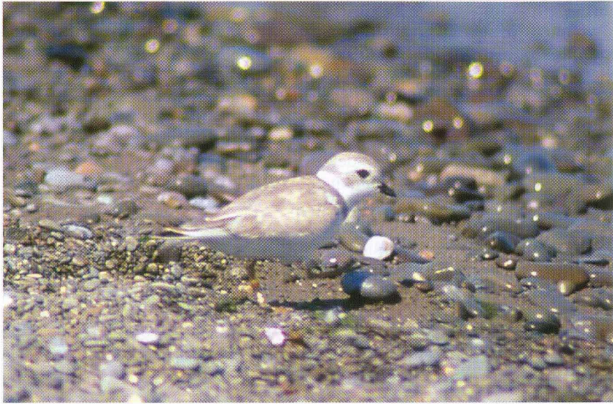
Figure 2: Juvenal Piping Plover at Van Wagners Beach, Hamilton-Wentworth , from 12 to 16 September 1999. Photo by Wilf Yusek .