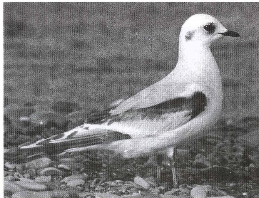
Figure 1: First basic Ross's Gull at Point Pelee National Park, Essex, on 17-18 May 1999.