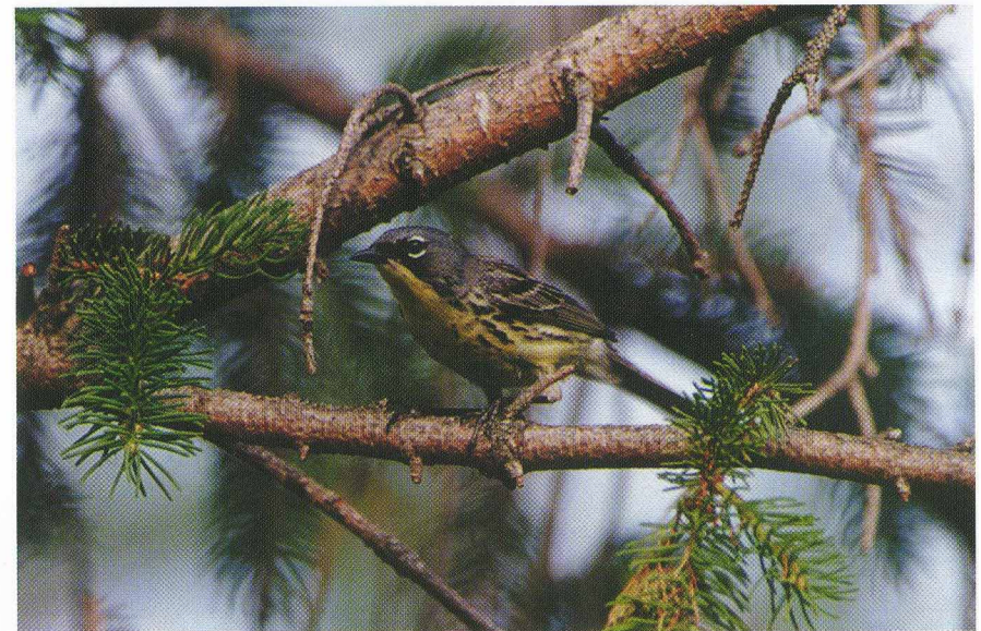
Figure 5: First alternate Kirtland's Warbler at Forest, Lambton , on 9-10 June 1999.