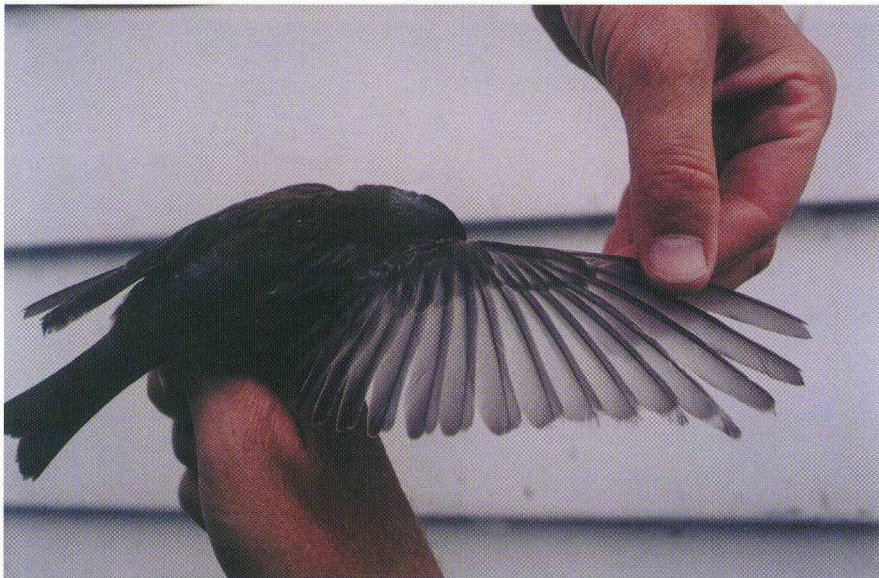
Figure 7: First basic male Gray-crowned Rosy-Finch, captured and banded, at Long Point Tip, Haldimand-Norfolk , from 8 to 10 July 1999.