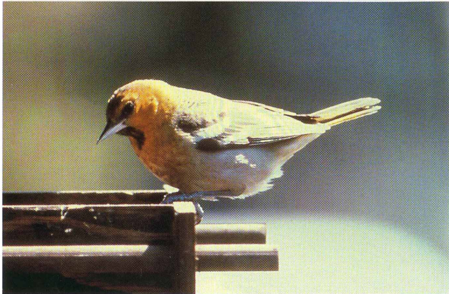
Figure 6: First alternate male Bullock's Oriole at Willowdale, Toronto , from 1 to 18 April 1980.