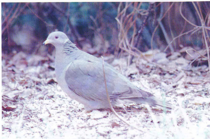
Figure 6: Basic Band-tailed Pigeon at Kingfisher Lake, Thunder Bay, from 26 May to 1 June 2000.