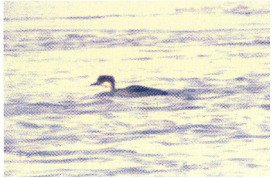
Figure 4: Female Smew on Niagara River at Miller's Creek, Niagara , on 22 February 1960.