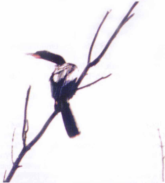
Figure 2: Definitive alternate/basic male Anhinga at Delaware, Middlesex , from 16 July to 16 September 2000.