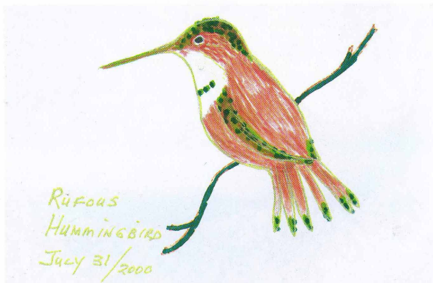
Figure 7: Male Rufous Hummingbird at Nipigon, Thunder Bay, from 31 July to 2 August 2000. Sketch by Lola Grimes.