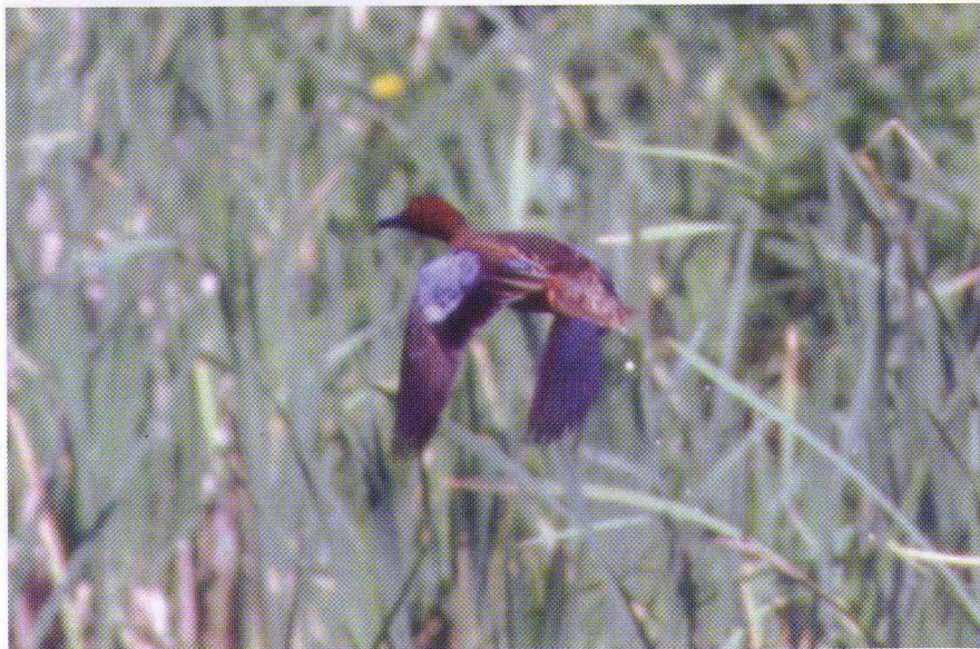
Figure 3: Alternate male Cinnamon Teal at Thunder Bay, Thunder Bay , on 3 June 2000.