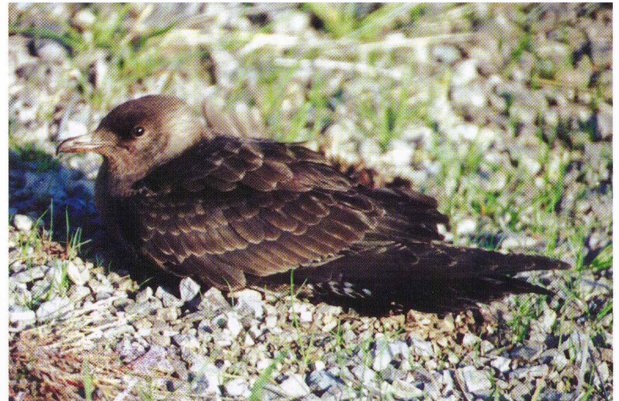
Figure 5: Juvenal Long-tailed Jaeger at Van Wagners Beach, Hamilton, Hamilton-Wentworth , on 28 October 1991.