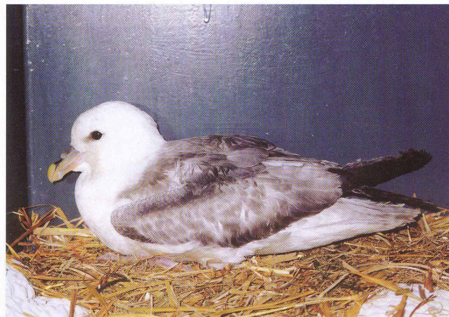
Figure 1: Female Northern Fulmar at Aurora, York, on 5 January 2000. This bird was found injured and incapable of flight, and was euthanized on 6 January 2000.

To the 2000 OBRC members, I thank you for your assistance and cooperation. Your continuing support is very much appreciated. To Rob Dobos, an extra thank you is extended for his valued advice.