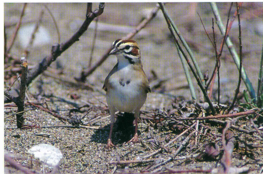
Figure 9: Alternate Lark Sparrow at Point Pelee National Park, Essex, on 17 May 2000.