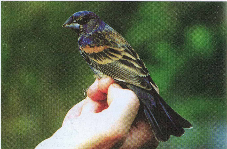
Figure 13: This first alternate, male Blue Grosbeak was captured and banded at Walsingham, Norfolk , on 15 May 2001.