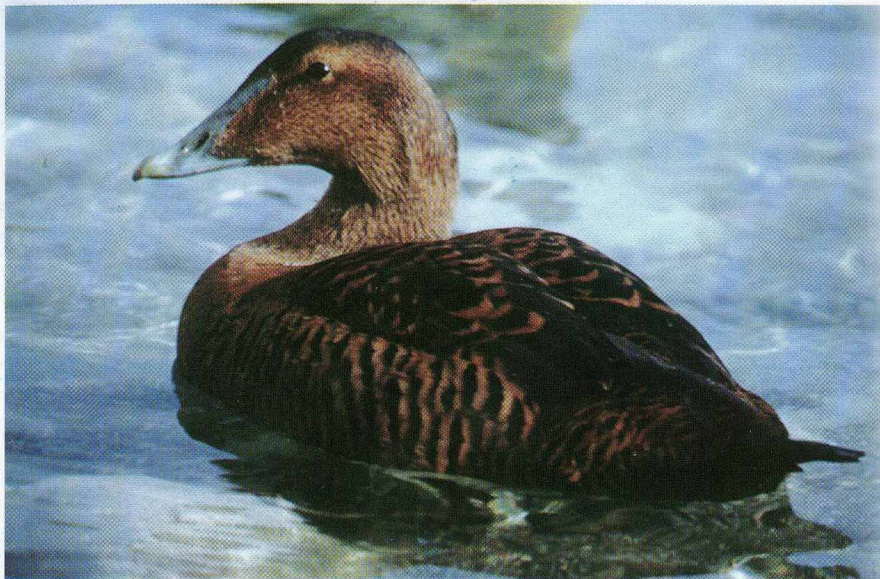
Figure 4: First basic, female Common Eider ( S. m. dresseri ) at Burlington, Halton , on 17 January 2001.