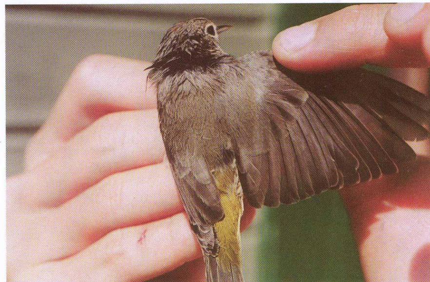
Figure 11: This first basic, male Virginia's Warbler was captured and banded at Thunder Cape, Thunder Bay , on 29 August 2001.