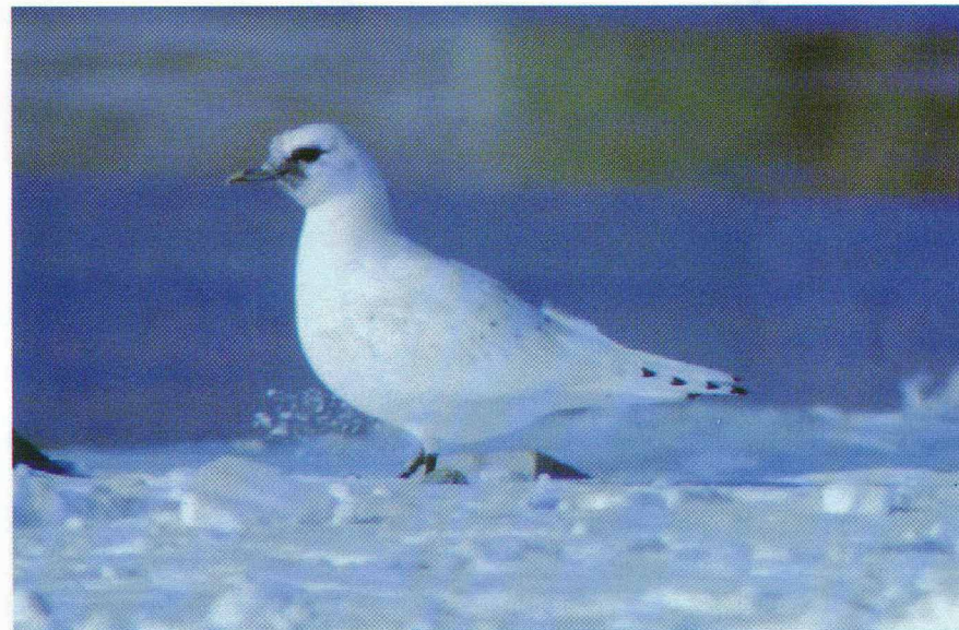
Figure 7: Ivory Gull, juvenal/first basic, at Humber Bay Park, Toronto , on 23 December 2000.