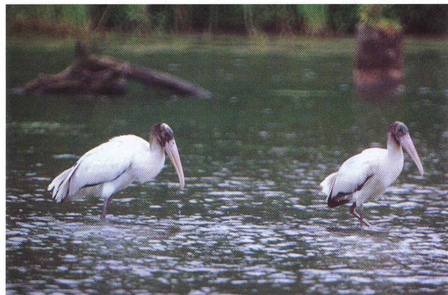
Figure 3: Two of three juvenal Wood Storks observed at Pelee Island, Essex, from 9 August to 22 September 2001.