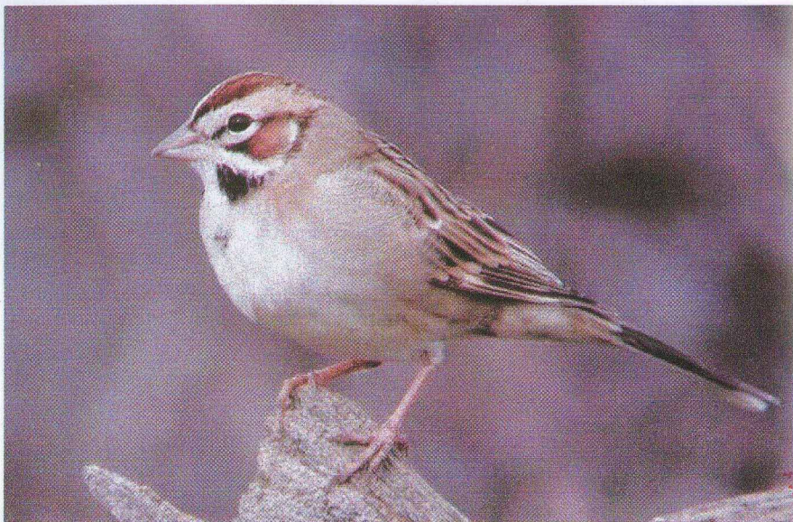
Figure 12: For the period 24 November to 22 December 2001, this basic Lark Sparrow was observed at Newburgh, Lennox and Addington .