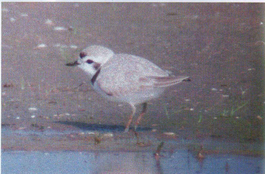
Figure 5: Definitive alternate Snowy Plover located at Presqu'île Provincial Park, Northumberland , 27 May 2001.