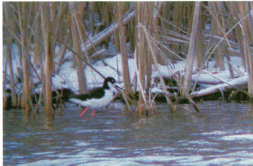
Figure 6: This definitive basic, female Black-necked Stilt, a very late lingering fall vagrant, was observed from 27 December 2001 to 2 January 2002 at Port Lambton, Lambton .