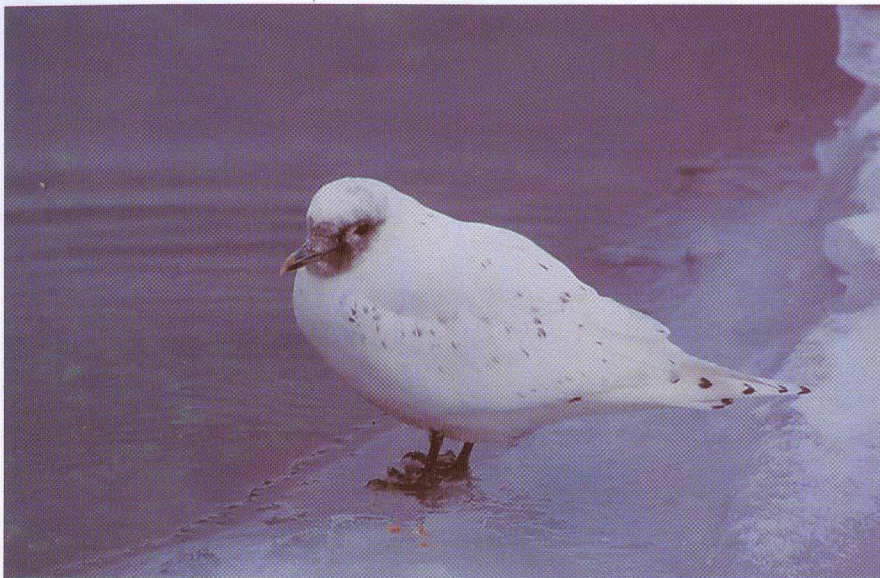
Figure 8: Ivory Gull, juvenal/first basic, at Amherst Island, Lennox and Addington , on 9 January 2001.