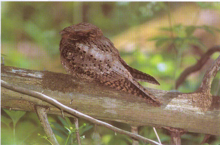
Figure 9: This basic, female Chuck-will's-widow, was located at Point Pelee National Park, Essex , on 13 May 2001.