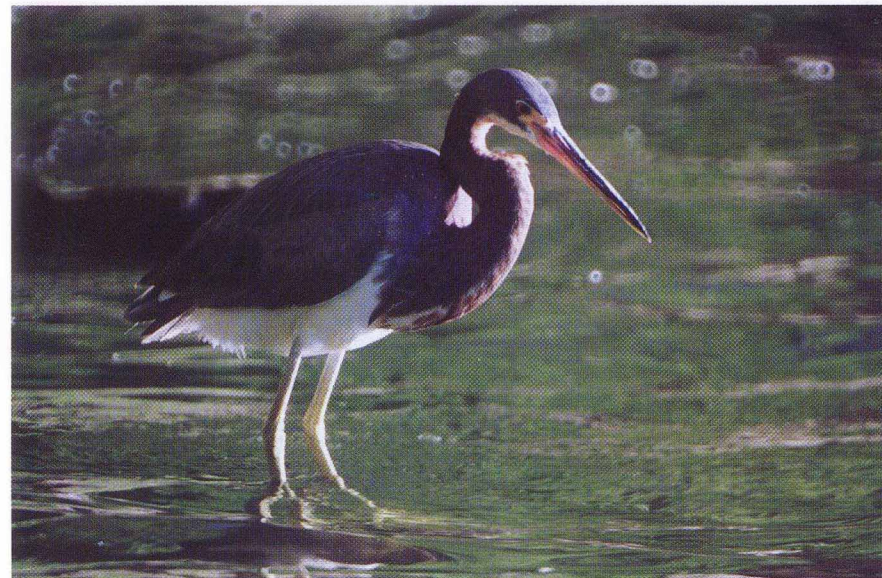
Figure 2: First alternate Tricolored Heron, found at Port Weller, Niagara, on 30 May 2001.