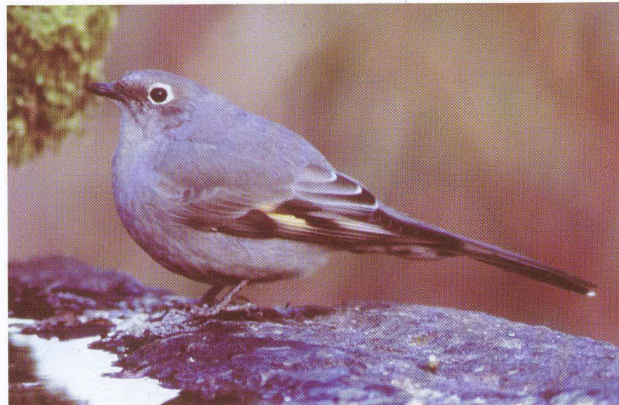
Figure 10: Townsend's Solitaire, observed at Copetown, Hamilton , 11 November 2001.