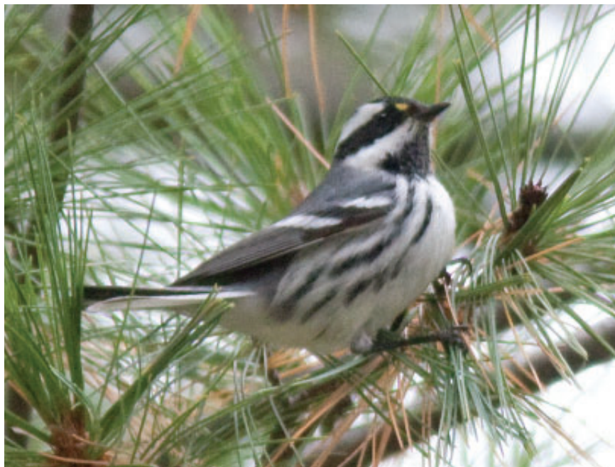
Figure 15: Black-throated Gray Warbler at Port Ryerse, Norfolk , from 11-12 October 2009.