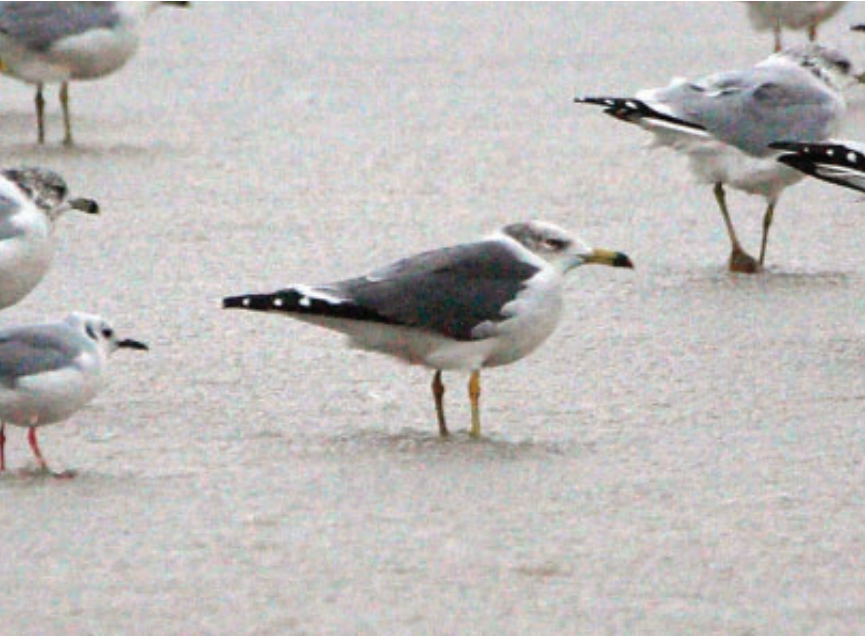
Figure 8: Definitive basic Black-tailed Gull, 28 September 2009, Port Burwell, Elgin .