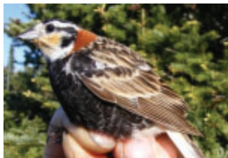
right: Figure 21: Definitive alternate male Chestnut-collared Longspur at Thunder Cape, Thunder Bay , on 30 May 2009.