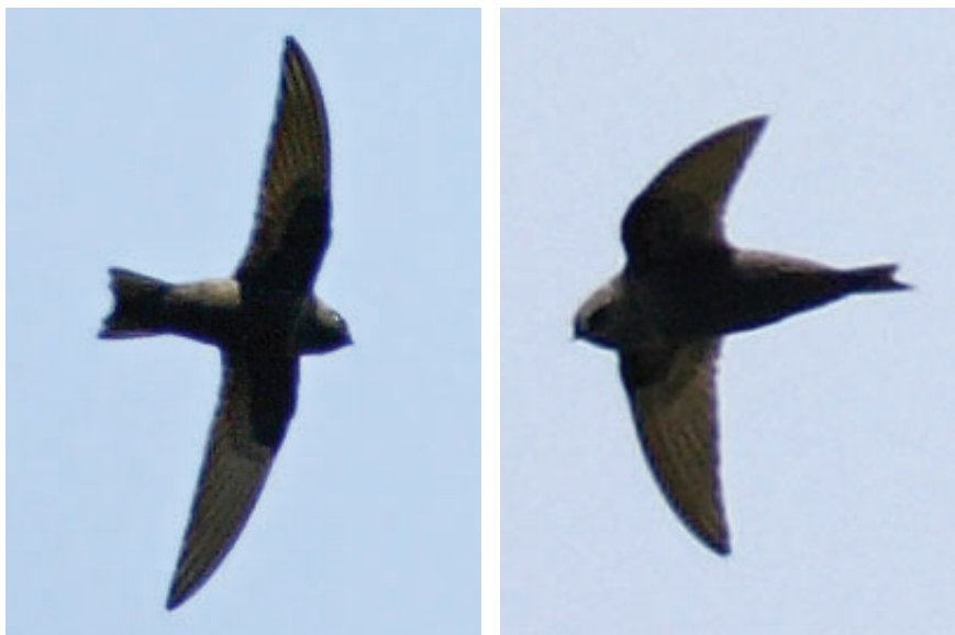
Figure 11: Male Black Swift at Point Pelee National Park, Essex , on 17-18 May 2009.