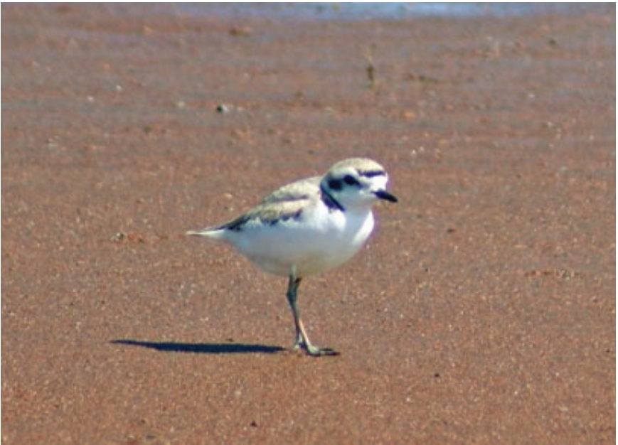
Figure 7: Snowy Plover at Wolf River mouth, Thunder Bay , 22-23 May 2009.