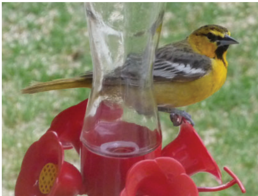
Figure 26: First alternate male Bullock's Oriole at Armstrong, Thunder Bay , from 1-10 June 2009.