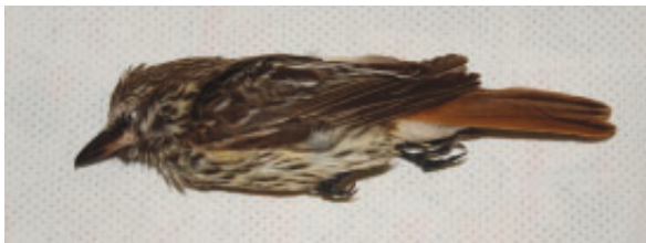
Figure 13: First basic Sulphur-bellied Flycatcher at Oakville, Halton , on 6 November 2009.