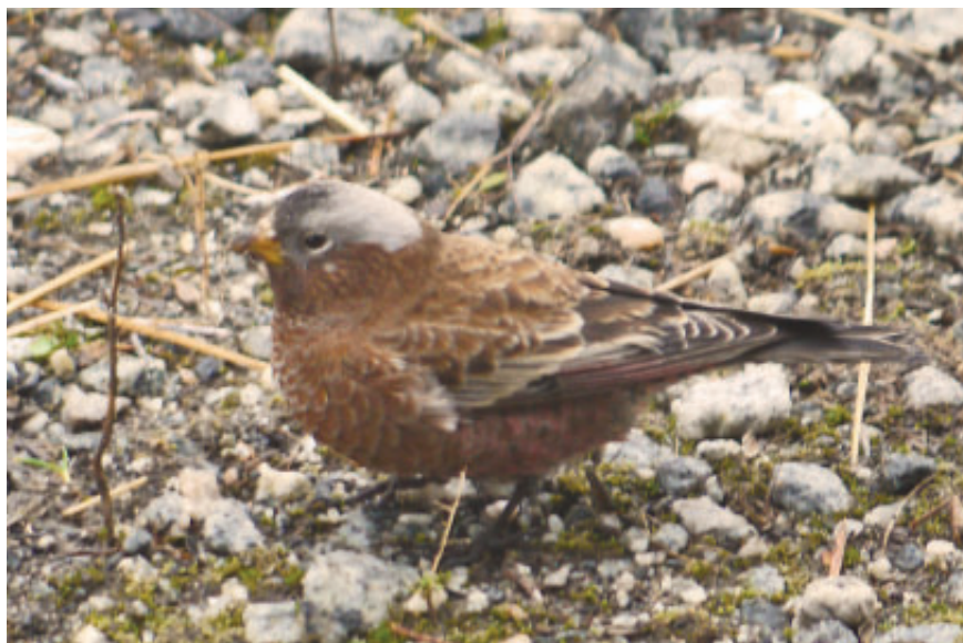
Figure 27: Basic Gray-crowned Rosy-Finch (n nominate tephrocotis ) at Moonbeam, Cochrane , on 20 November 2009.