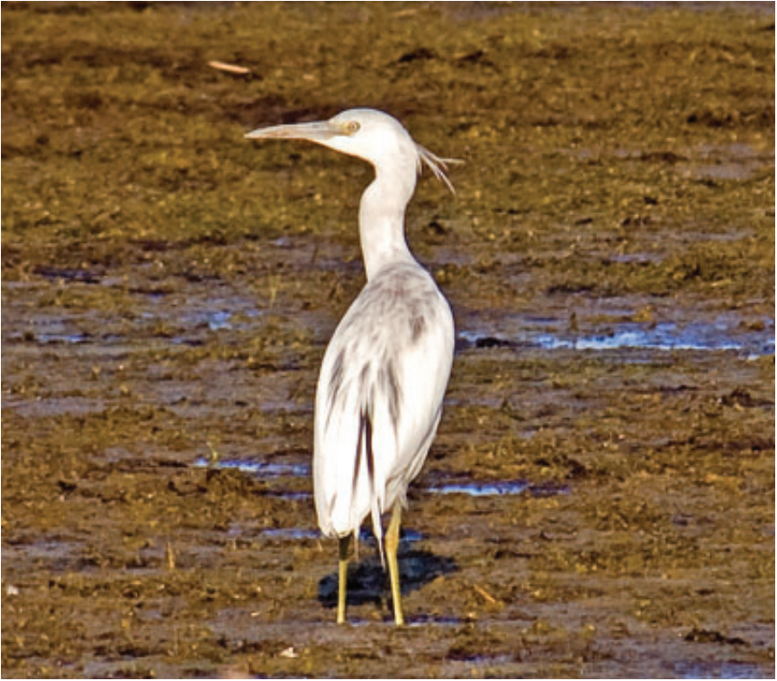
Figure 3: Little Blue Heron at Kingston, Frontenac , on 13 May 2009.