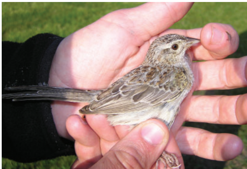
Figure 17: Cassin's Sparrow at Long Point (Tip), Norfolk, on 30 May 2007.