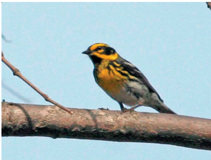
Figure 16: Townsend's Warbler at Rondeau Provincial Park, Chatham-Kent, on 8 May 2009.