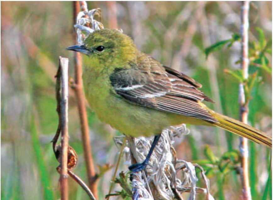
Figure 25: Female Orchard Oriole at Terrace Bay, Thunder Bay , on 29 May 2009.