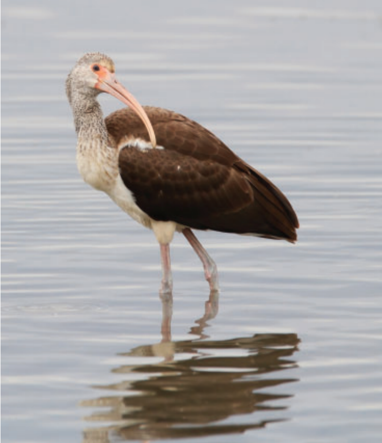
Figure 4: Juvenal White Ibis at Whitby Harbour, Durham, on 3 October 2009.