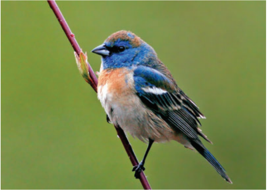
Figure 24: First alternate male Lazuli Bunting at Crooks, Thunder Bay , from 31 May to 3 June 2009.