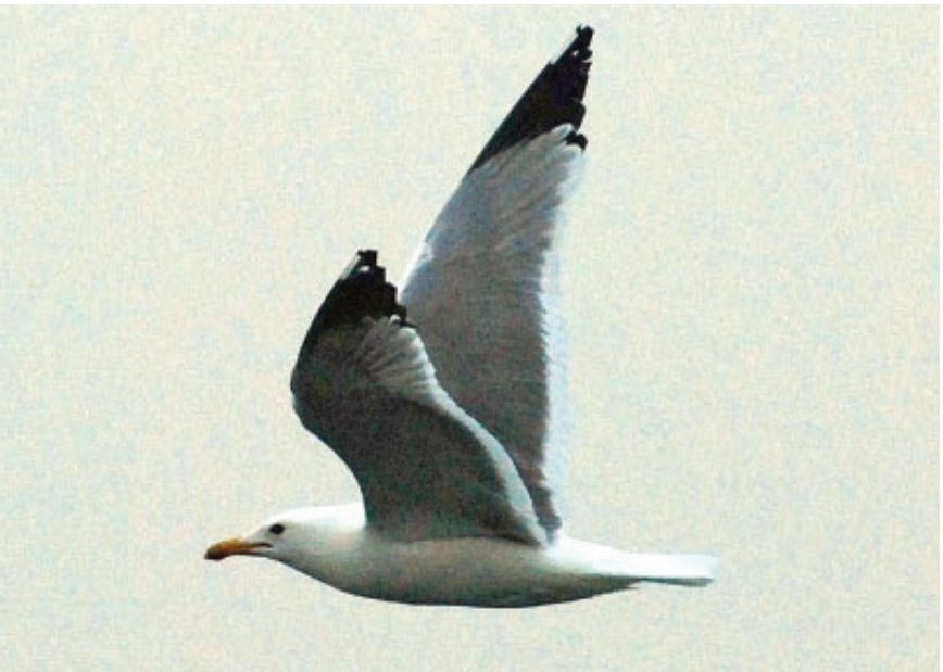
Figure 9: Third alternate or definitive alternate California Gull, on 9 May 2009, at Point Pelee National Park, Essex .