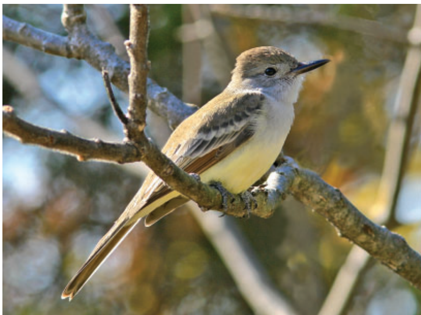
Figure 12: Ash-throated Flycatcher in first basic plumage at Point Pelee National Park, Essex , on 6 November 2009.