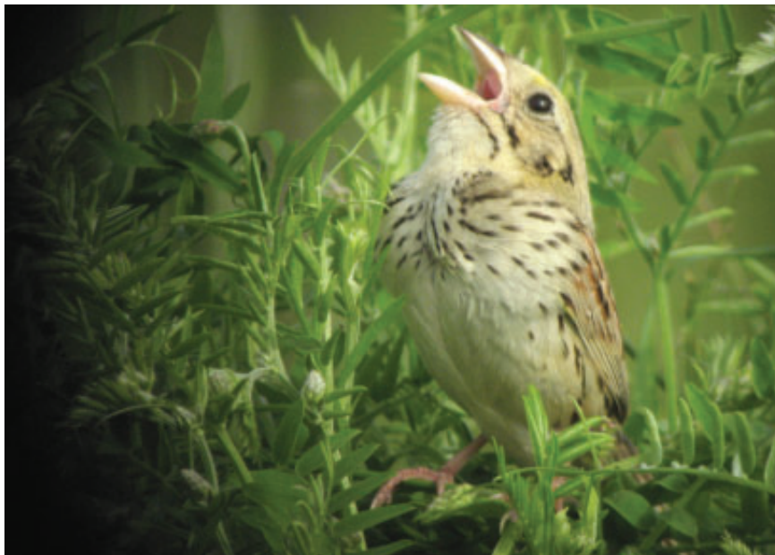
Figure 19: Alternate male Henslow's Sparrow from 27-29 July 2009 at Paskwachi Point, Cochrane .