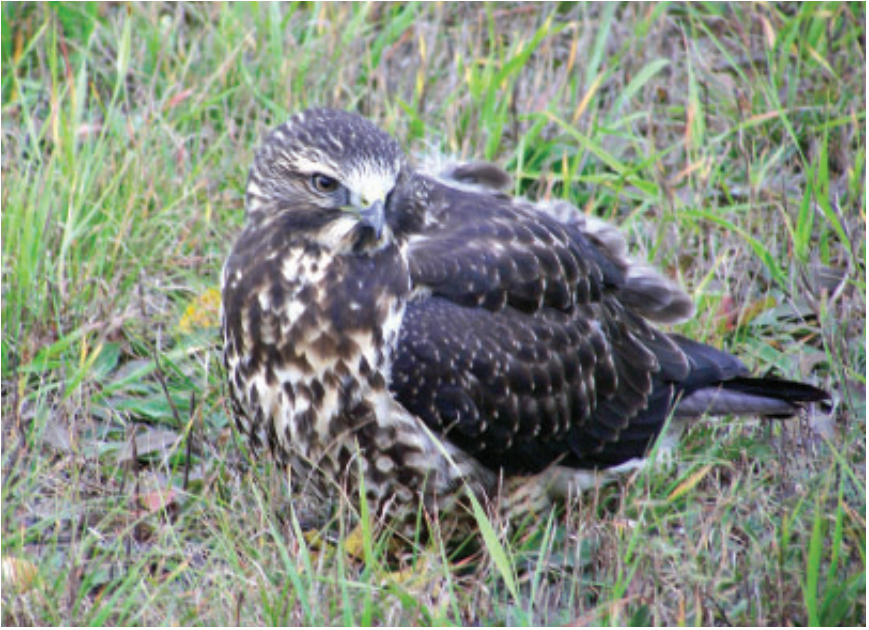
Figure 6: Juvenal intermediate morph Swainson's Hawk at Thunder Bay, Thunder Bay , on 28 September 2009.