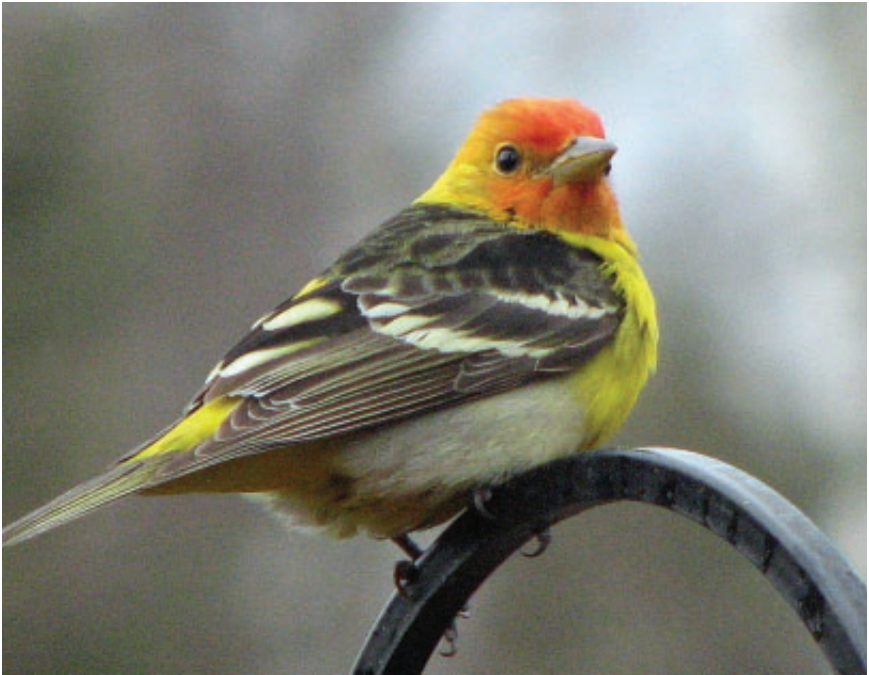
Figure 22: Western Tanager at Pass Lake, Thunder Bay , 27 April to 6 May 2008.