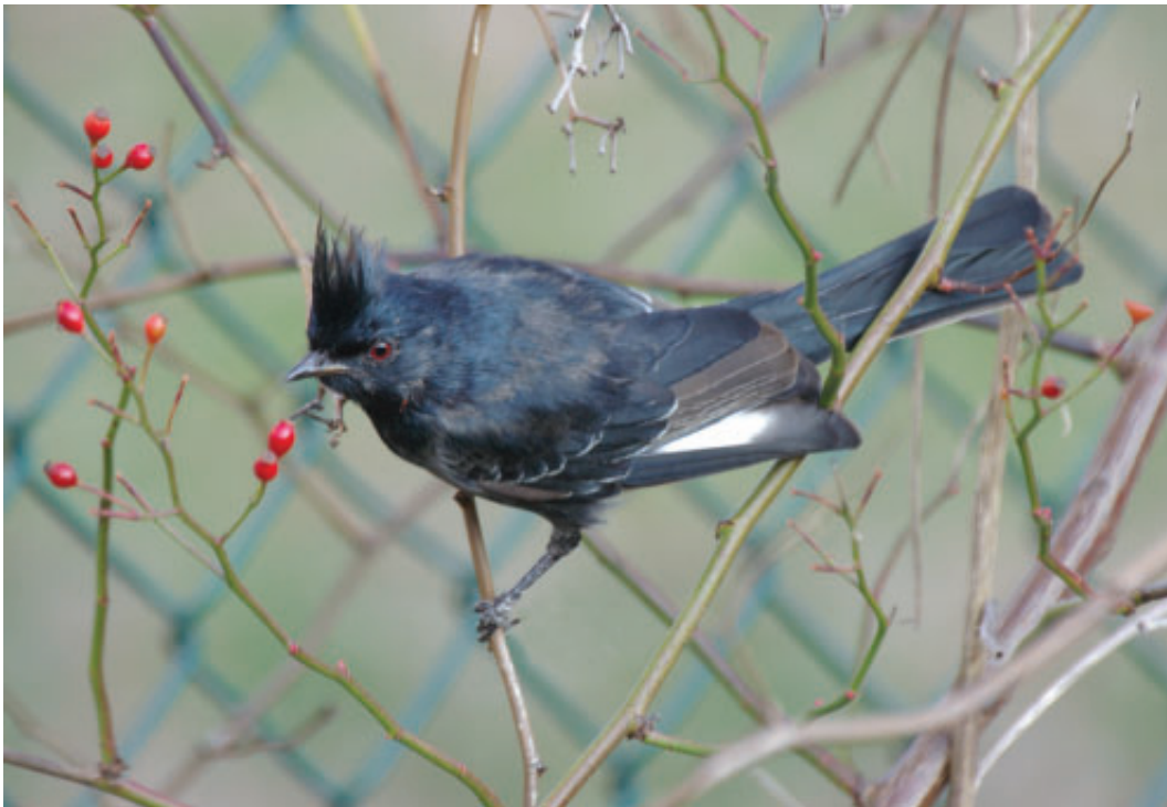
Figure 14: Male Phainopepla moulting into first basic plumage from 9 November 2009 to 9 February 2010 at Brampton, Peel.