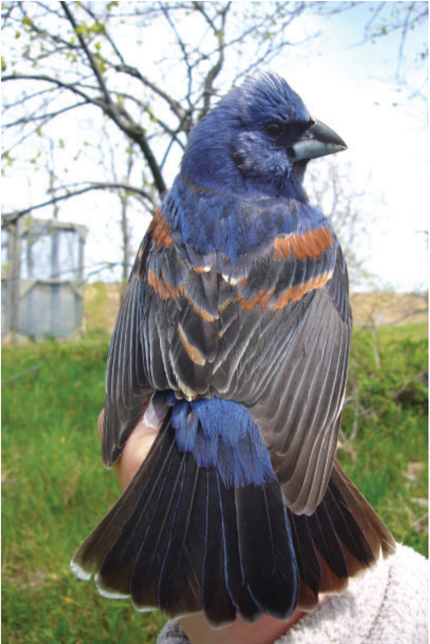
Figure 23: Definitive alternate male Blue Grosbeak at Long Point (Courtright Ridge), Norfolk, on 16 May 2008.