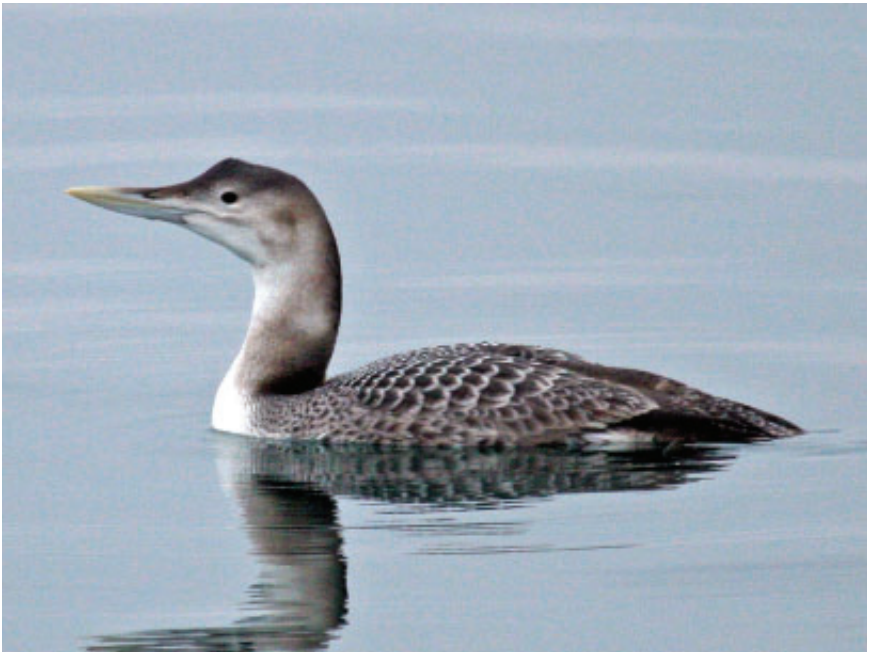
Figure 2: Juvenal Yellow-billed Loon Sault Ste. Marie, Algoma, from 31 December 2009 to 2 January 2010.