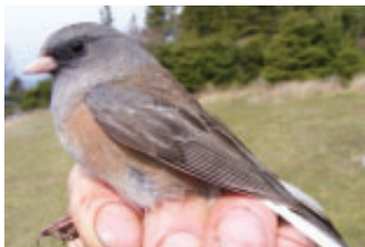
left: Figure 20: First basic female "Pink-sided" Dark-eyed Junco at Thunder Cape, Thunder Bay , on 12 May 2009.