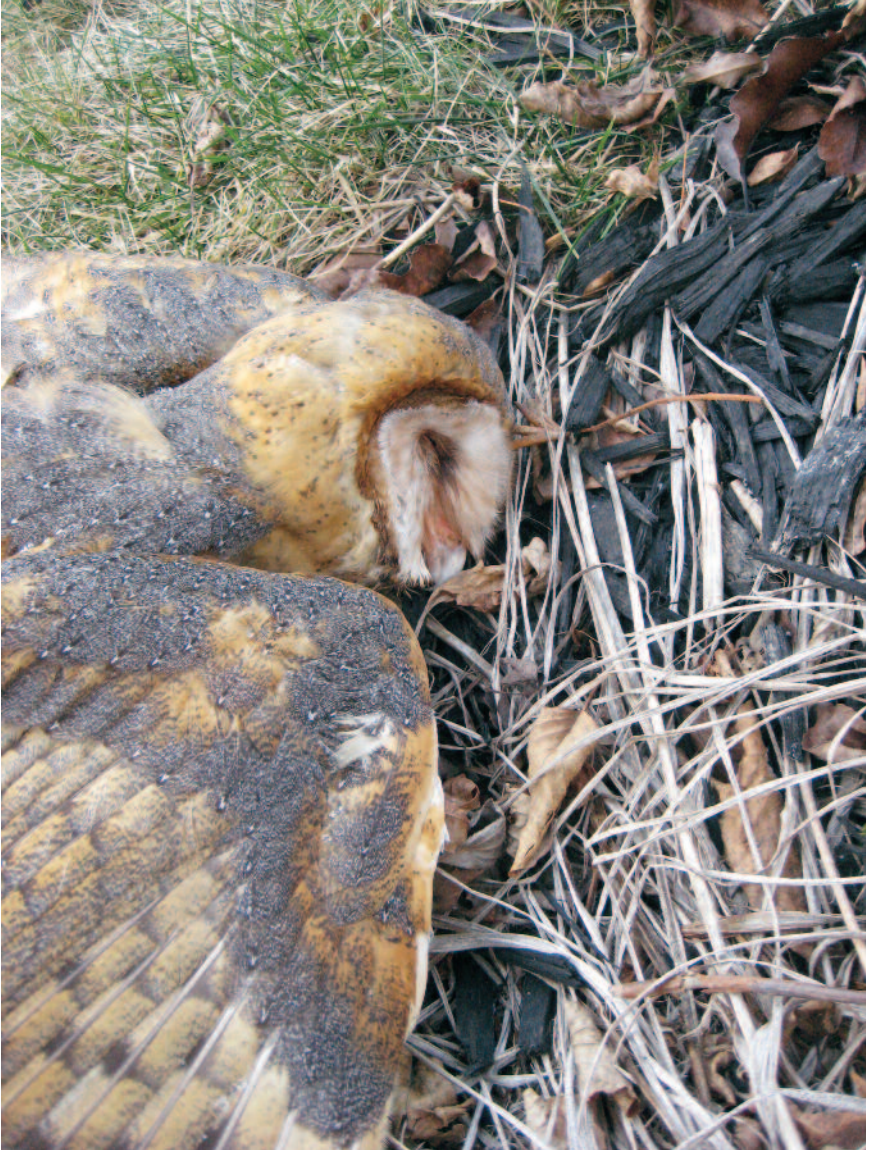
Figure 16: Barn Owl at Whitby, Durham on 17 December 2011.