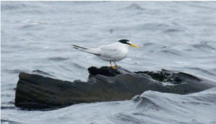
Figure 14: Least Tern on 10 May 2011 at Atikokan, Rainy River .