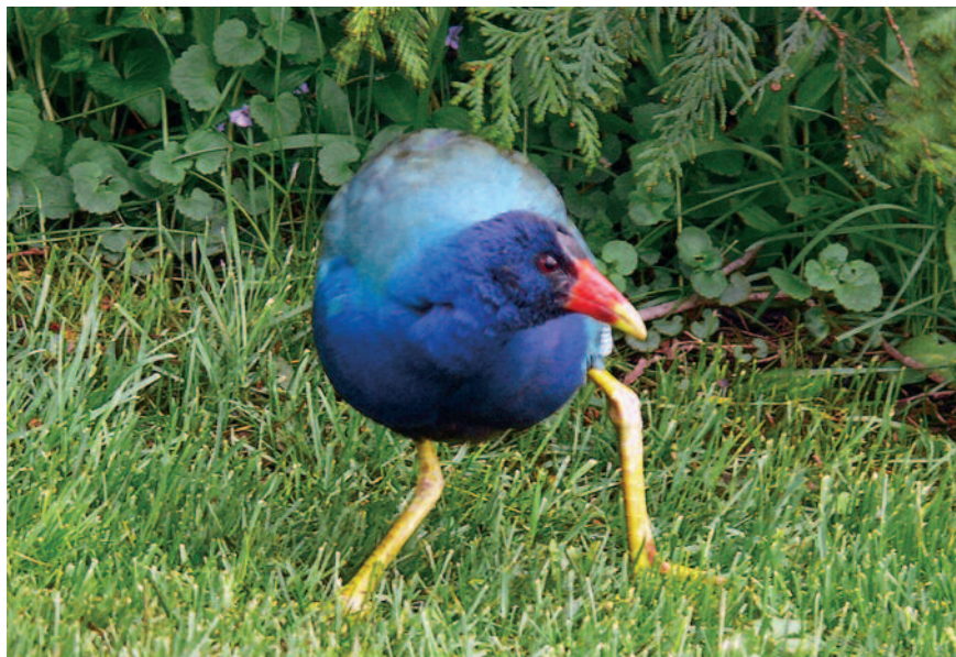
Figure 9: Purple Gallinule, 14-23 May 2011 at Kincardine, Bruce . Photo: James A. Turland (23 May).