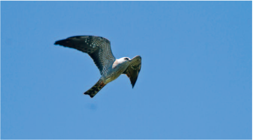
Figure 7: First basic Mississippi Kite at Point Pelee National Park, Essex , 24 May 2011.