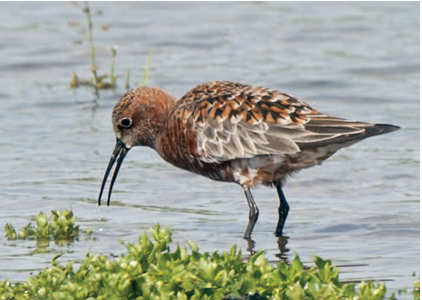
Figure 11: Curlew Sandpiper at Blenheim, Chatham-Kent on 17 May 2011.