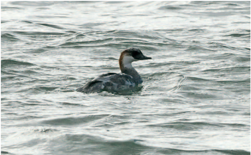
Figure 26: Male Smew at Whitby, Durham on 26 December 2011.

This species does exhibit a tendency to wander and there are two accepted records for the province (Roy 2001). However, consensus could not be reached regarding wild origin. Three members of the current committee have agreed to research the wild status of Smew and report to the 2012 committee.