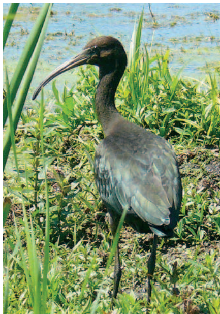
Figure 6: Plegadis Ibis at Lakeview Heights (Cornwall), Stormont, Dundas and Glengarry from 23 July to 10 August, 2011. Photo: Dawn Scranton (28 July)