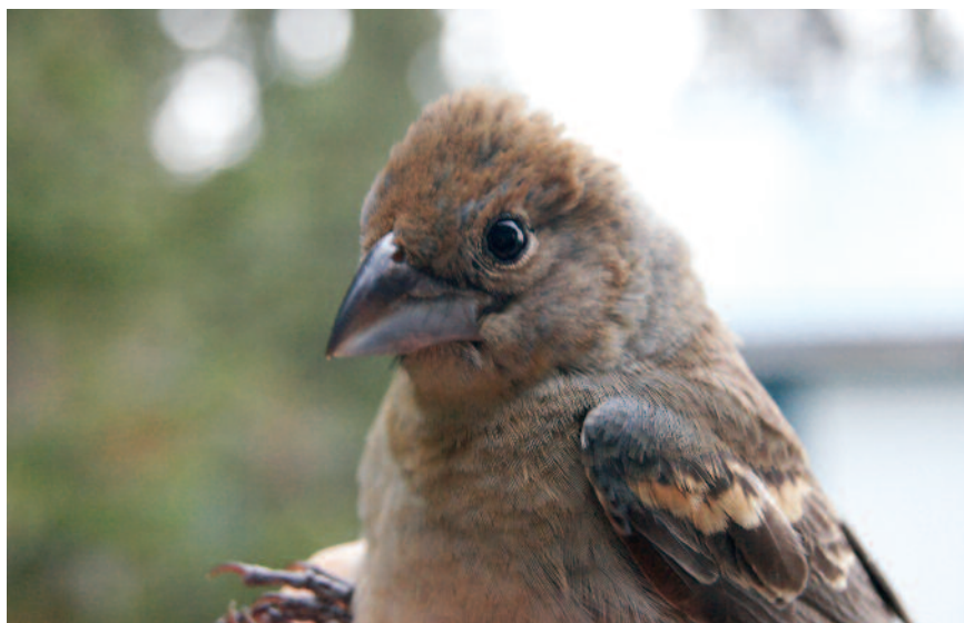
Figure 22: First alternate male Blue Grosbeak at Thunder Cape, Thunder Bay from 31 May to 1 June 2011.