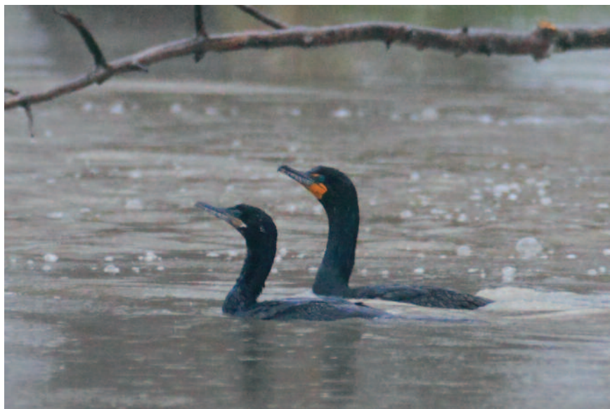
Figure 4: Neotropic Cormorant (on left), Wheatley, Essex on 24 April 2011.