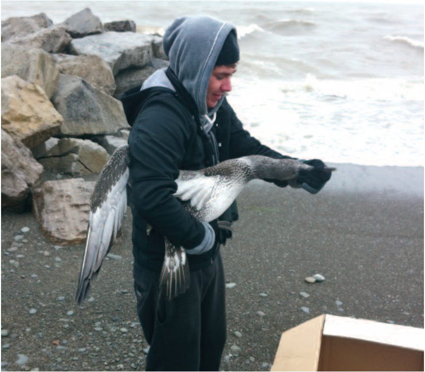
Figure 3: Northern Gannet release at Van Wagner's Beach, Hamilton on 26 October 2011.