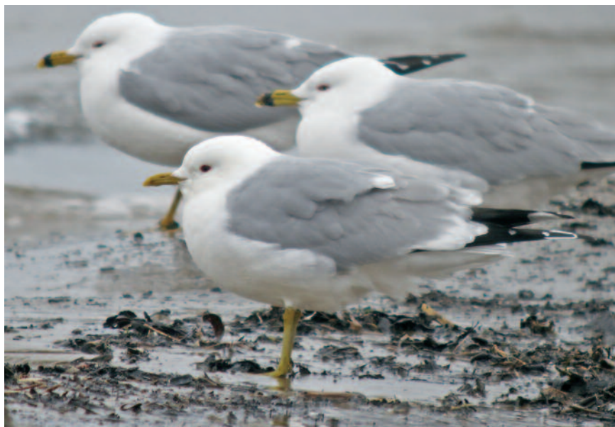
Figure 12: "Common" Mew Gull at Cobourg Harbour, Northumberland on 23 March 2011.