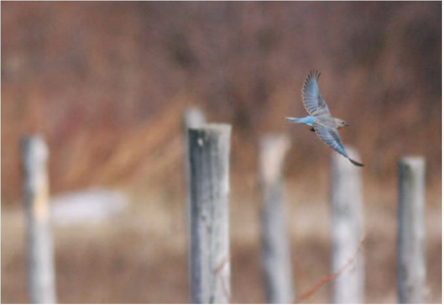
Figure 19: First basic, female Mountain Bluebird from 19-24 March 2011 at Vinemount, Hamilton .  (22 March).