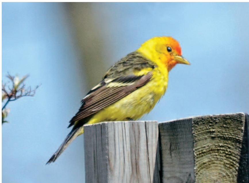
Figure 21: Western Tanager at Rondeau Provincial Park, Chatham-Kent on 19 May 2011.