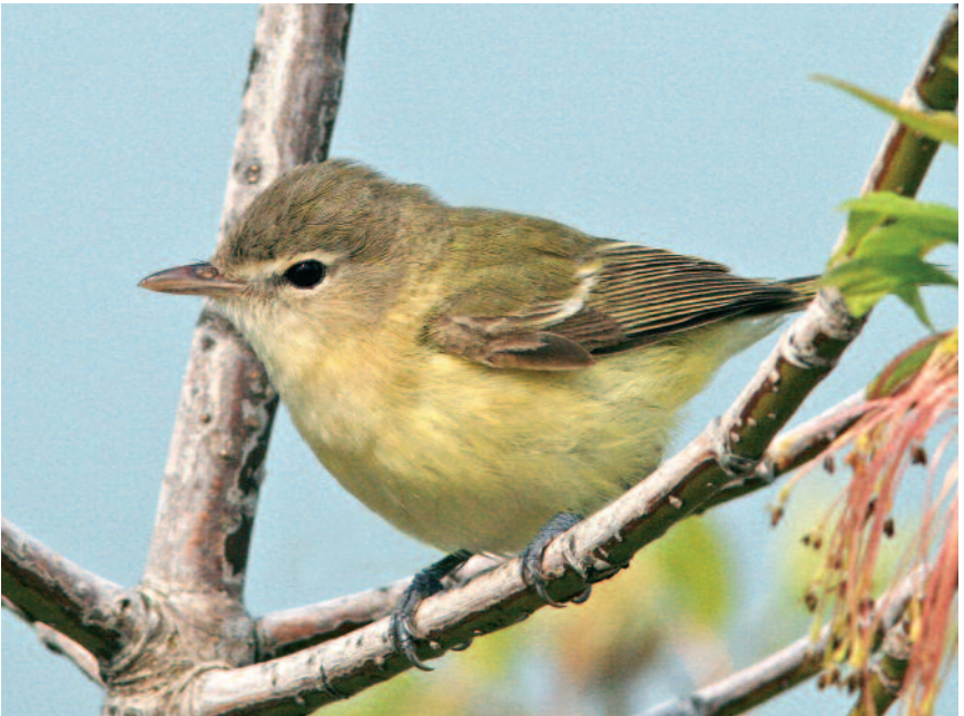
Figure 18: First basic Bell's Vireo on 13 May 2011 at Point Pelee National Park, Essex .