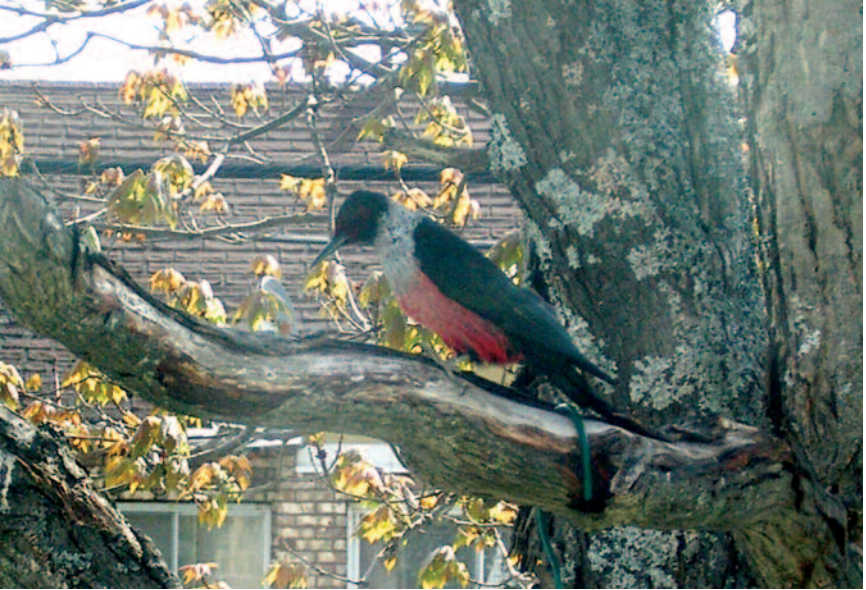
Figure 17: Lewis's Woodpecker at Kirkland Lake, Timiskaming from 22-30 May 2011.