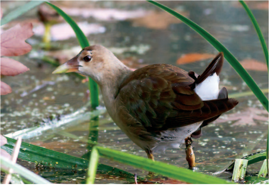
Figure 10: Purple Gallinule at Burlington (Hendrie Valley), Halton on 16 October 2011.