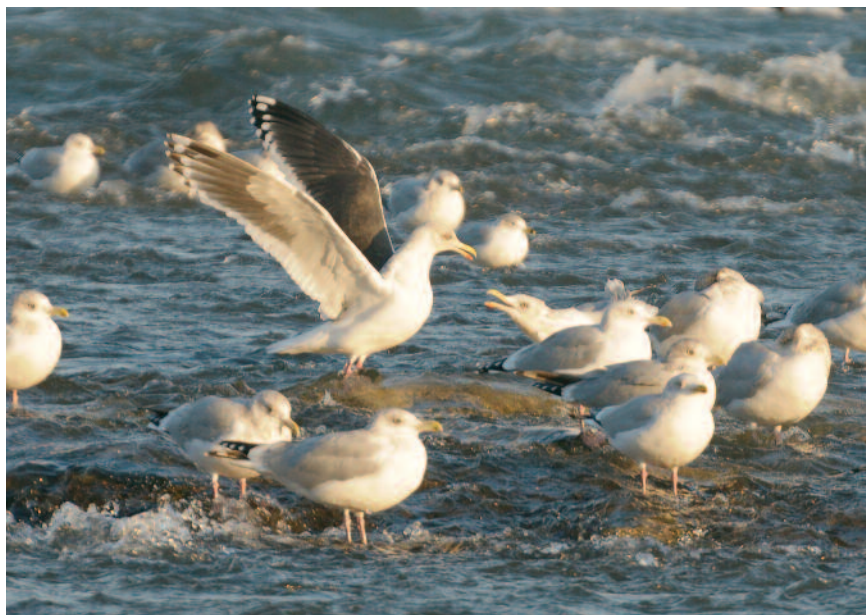
Figure 13: Slaty-backed Gull at Niagara Falls, Niagara from 3-13 December 2011. Photo: James M. Pawlicki (8 December).