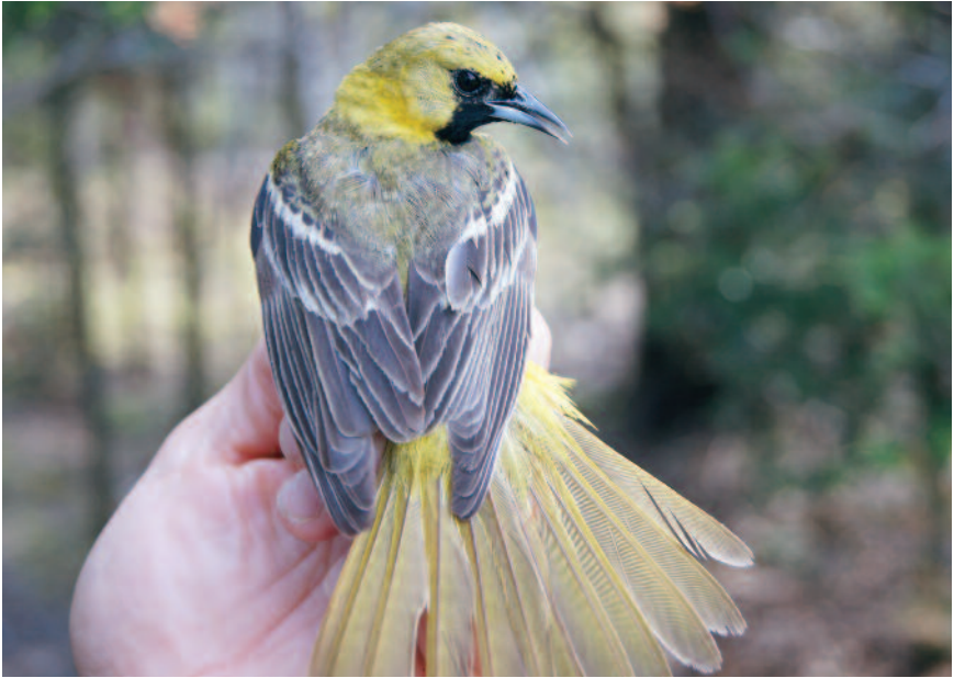
Figure 23: Orchard Oriole at Thunder Cape, Thunder Bay from 31 May to 4 June 2011.