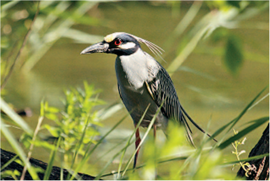
Figure 5: Yellow-crowned Night-Heron at Windsor, Essex , on 1 June 2011.