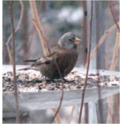
Figure 24: Basic Gray-crowned Rosy-Finch ( littoralis ) at Stepstone, Thunder Bay on 22 November 2011.