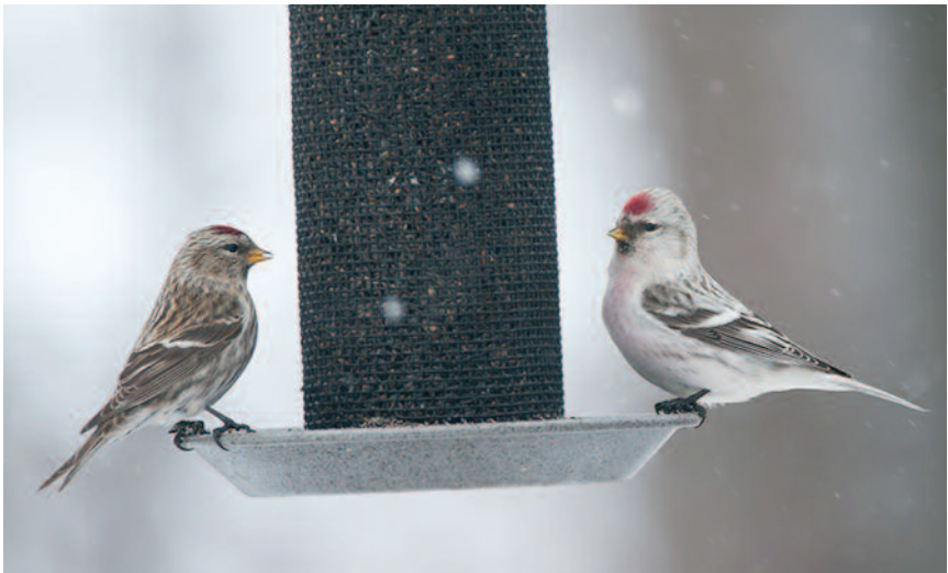
Figure 25: "Hornemann's" Hoary Redpoll at North Frontenac, Frontenac on 25 February 2011.