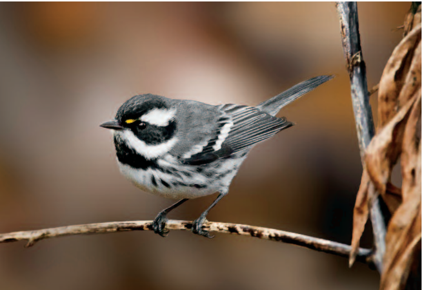
Figure 20: Black-throated Gray Warbler at Hamilton, Hamilton from 14 December 2011 to 1 January 2012. Photo: Mike Veltri (15 December).