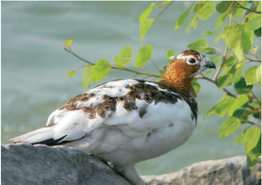
Figure 2: Willow Ptarmigan Darlington Generating Station, Durham from 8 June to 30 November 2011. (8 June).