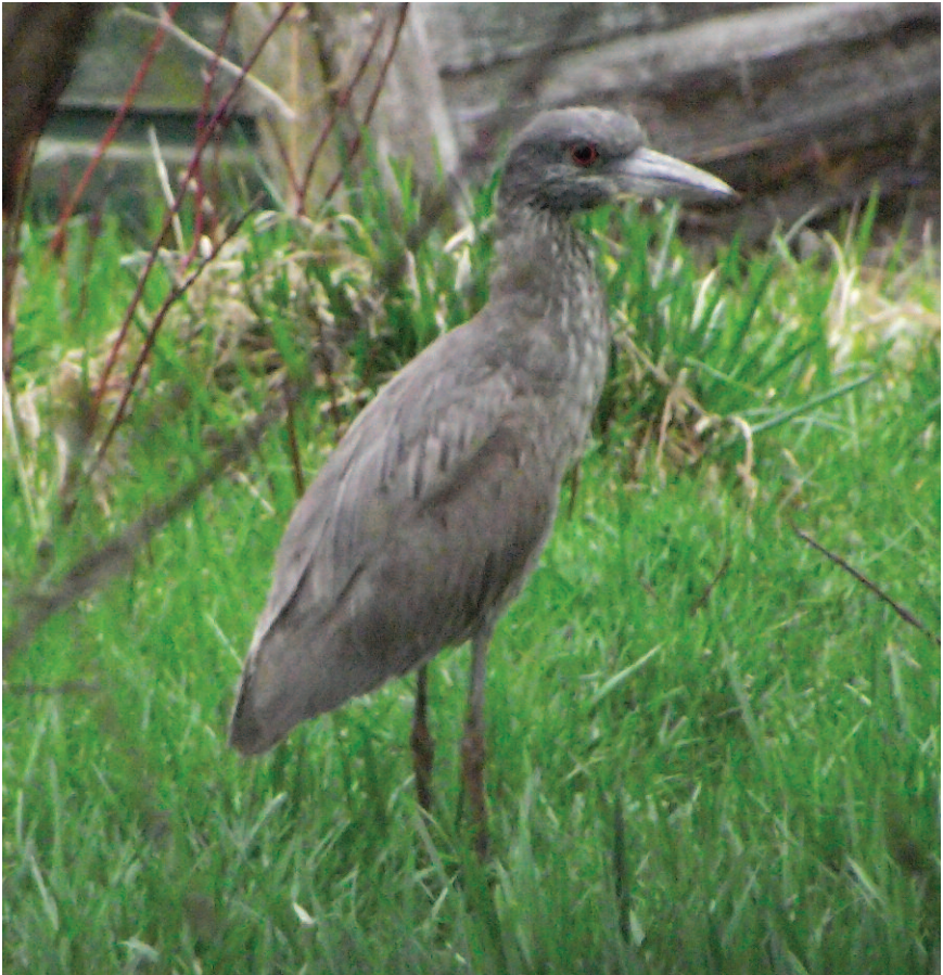
Figure 5: Yellow-crowned Night-Heron, Lindsay, Kawartha Lakes on 30 April 2013.