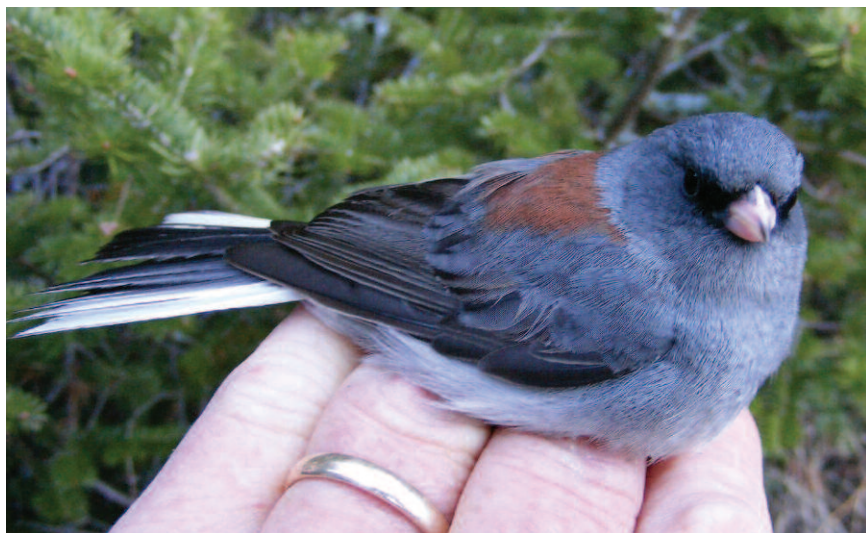
Figure 15: "Gray-headed" Dark-eyed Junco, Thunder Cape, Thunder Bay on 15 May 2013.