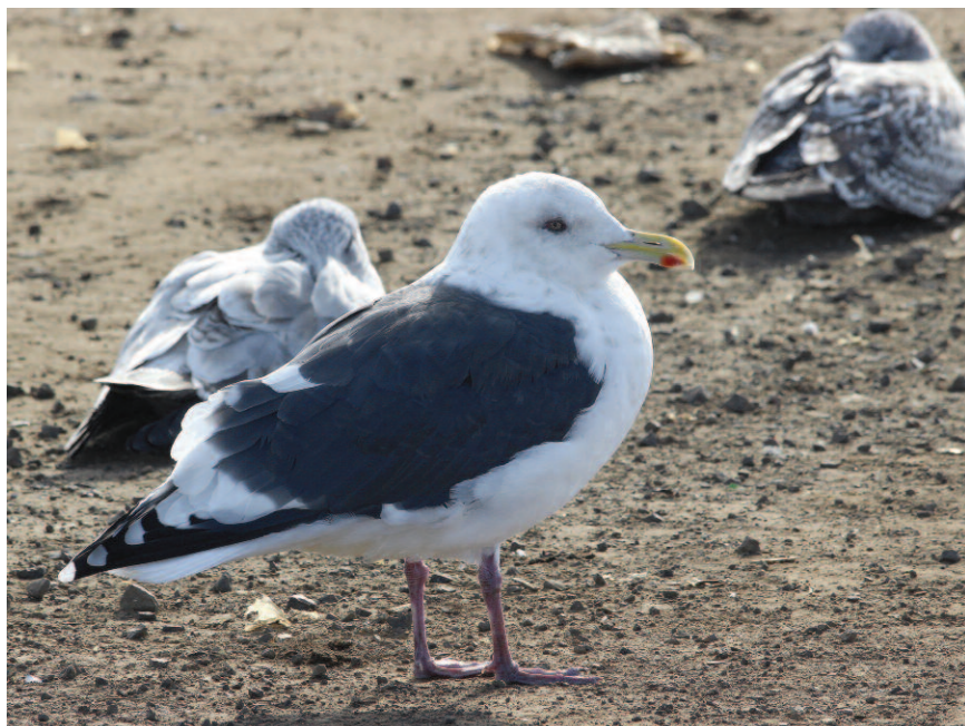
Figure 8: Slaty-backed Gull, Thunder Bay, Thunder Bay on 8 November 2013.