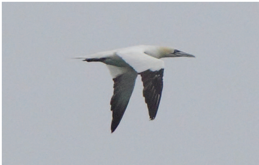
Figure 4: Northern Gannet, Stoney Creek, Hamilton on 1 September 2013.