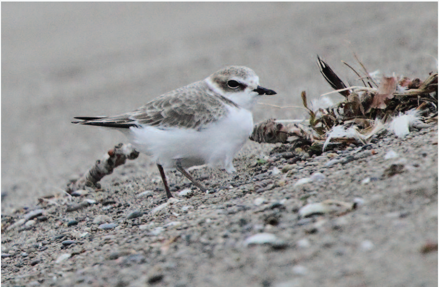
Figure 7: Snowy Plover, Point Pelee National Park, Essex on 1 November 2013.