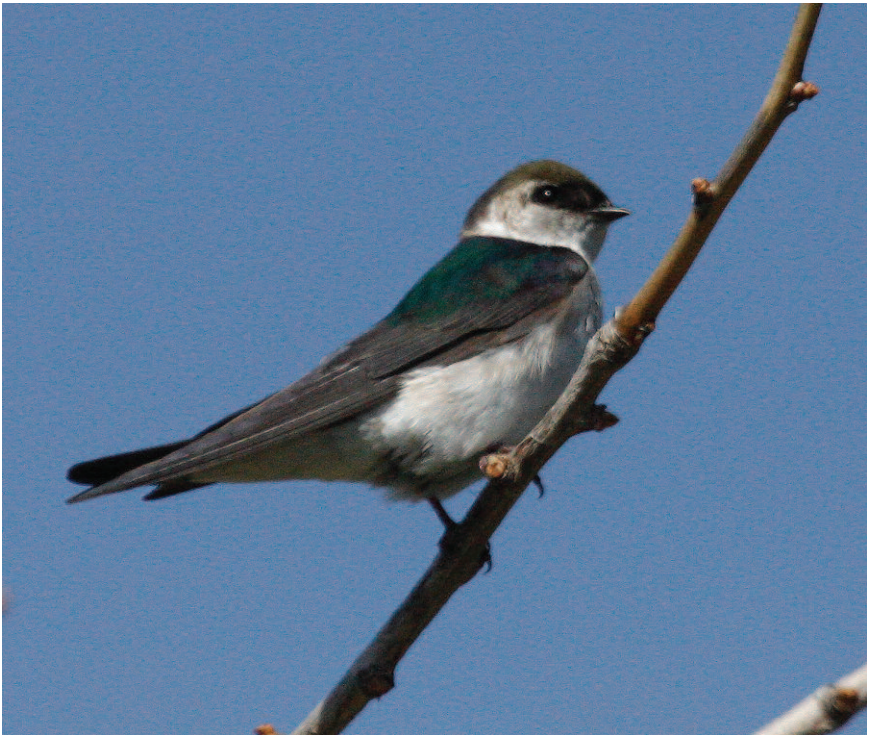
Figure 13: Violet-green Swallow, Britannia, Ottawa on 25 April 2013.

This is the first record for southern Ontario. The first provincial record was at Thunder Cape, Thunder Bay on 28-29 October 1992 (Bain 1993)