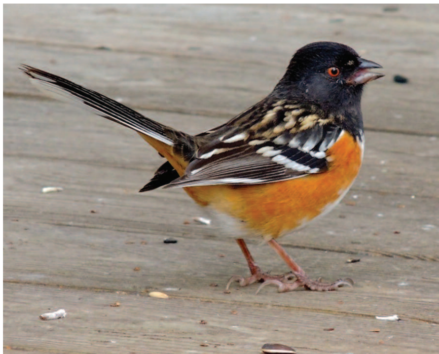
Figure 14: Spotted Towhee, Glenn Williams, Halton on 18 January 2014.