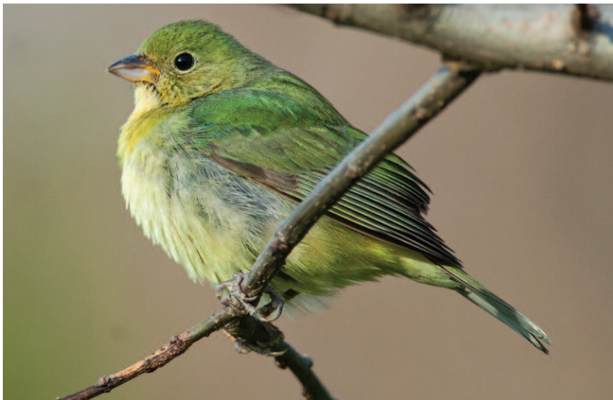
Figure 17: Painted Bunting, Sturgeon Creek, Essex on 29 April 2013.