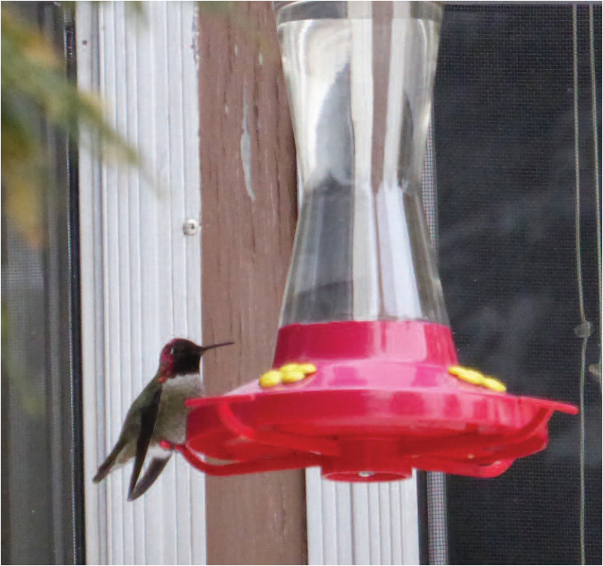
Figure 10: Anna's Hummingbird, Thunder Bay, Thunder Bay on 3 December 2013.