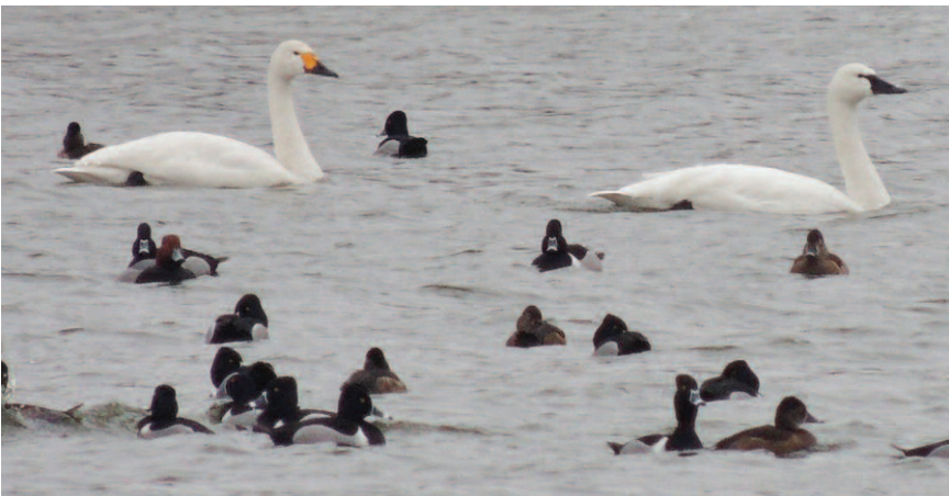
Figure 2: “Bewick’s” Tundra Swan (left) with “Whistling” Tundra Swan (right), Ridgetown, Chatham-Kent on 15 March 2013.