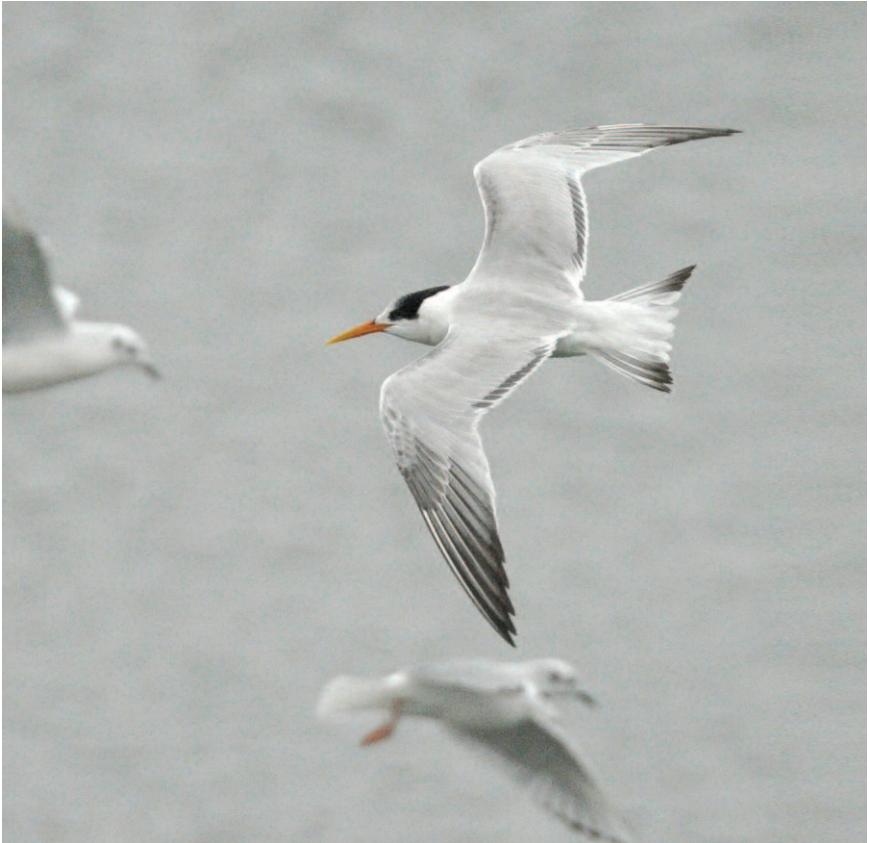
Figure 9: Elegant Tern, Buffalo, New York, on 21 November 2013. This same individual provided the first Ontario record when it crossed the river into Canadian waters.