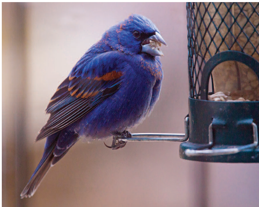
Figure 16: Blue Grosbeak, Windsor, Essex on 20 April 2013.