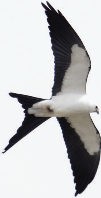
Figure 6: Swallow-tailed Kite, Port Alma, Chatham-Kent on 4 May 2013.