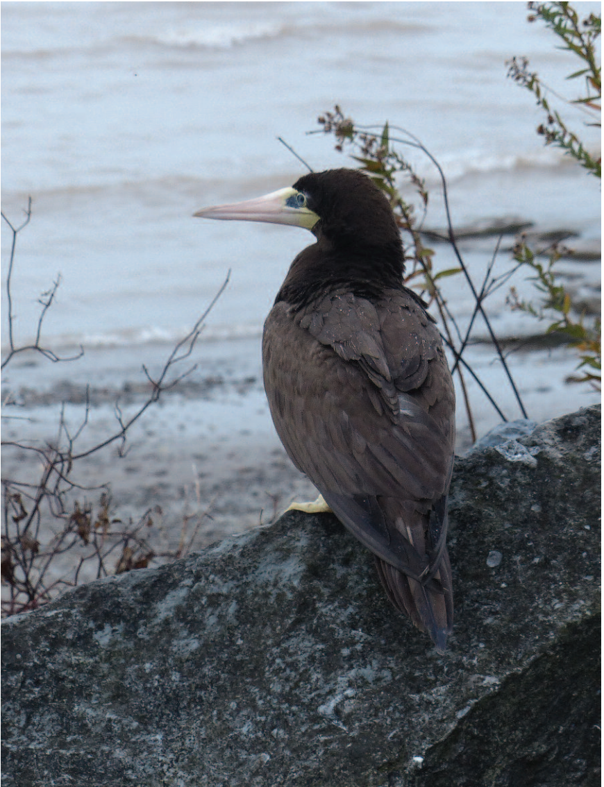
Figure 3: Brown Booby, Lowbanks, Haldimand on 2 November 2013.