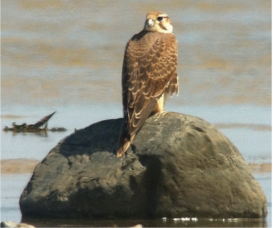
Figure 11: Prairie Falcon, Little Piskwamish Point, Cochrane on 2 August 2013.