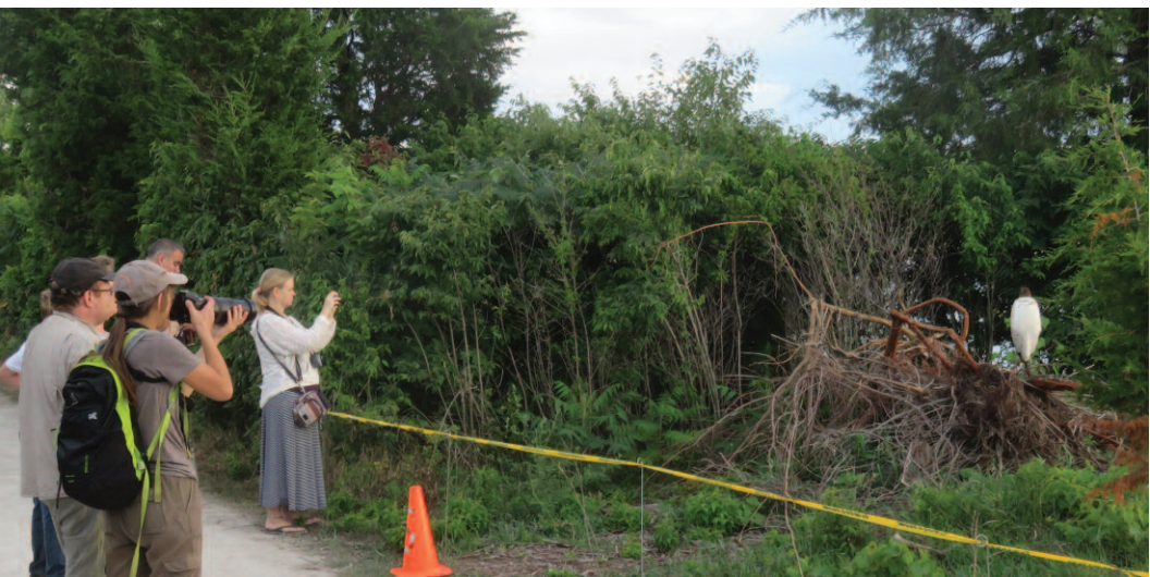
Figure 5. Birders enjoying the incredibly tame Wood Stork at Point Pelee National Park, Essex on 12 August 2017.