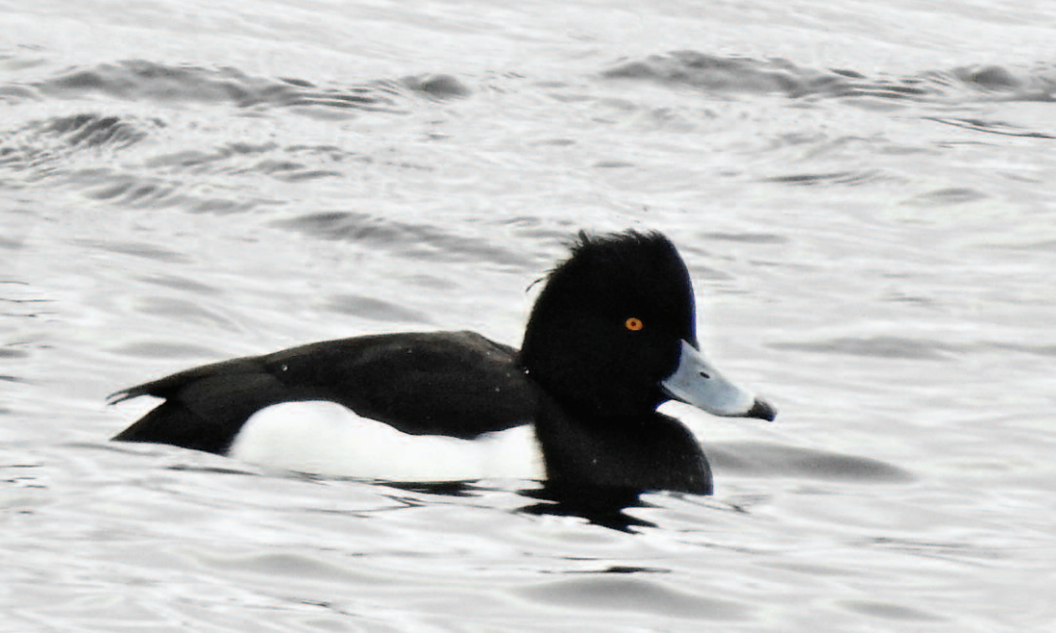
Figure 2. Tufted Duck at Mississauga, Peel on 17 December 2017.