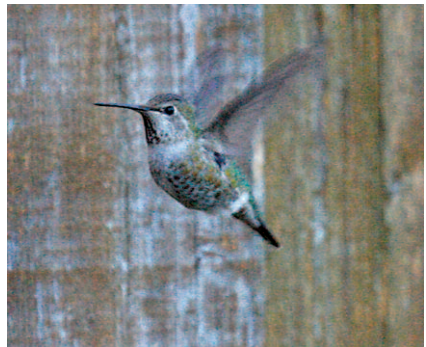
Figure 15. Anna's Hummingbird at Carleton Place, Lanark on 10 November 2017.

A close runner-up for bird of the year! Just the third provincial record, this was the first individual that was accessible to southern Ontario birders. As such, hundreds of individuals were able to enjoy this bird during its stay.