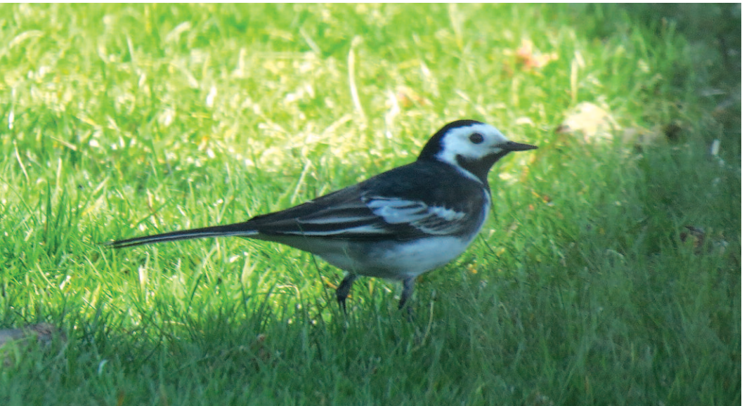
Figure 20. White Wagtail of the subspecies yarellii (“Pied Wagtail”) at Port Colborne, Niagara on 16 April 2017.

2017 – one, first basic male, 29 November-19 December, Oakville, Halton (Cheryl E. Edgecombe, Dominik Halas; 2017-007) – photos on file.