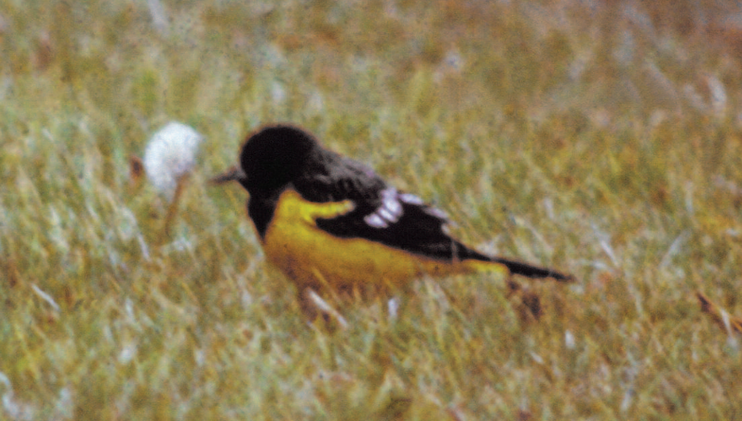
Figure 23. Scott's Oriole at Silver Islet, Thunder Bay on 9 November 1975.