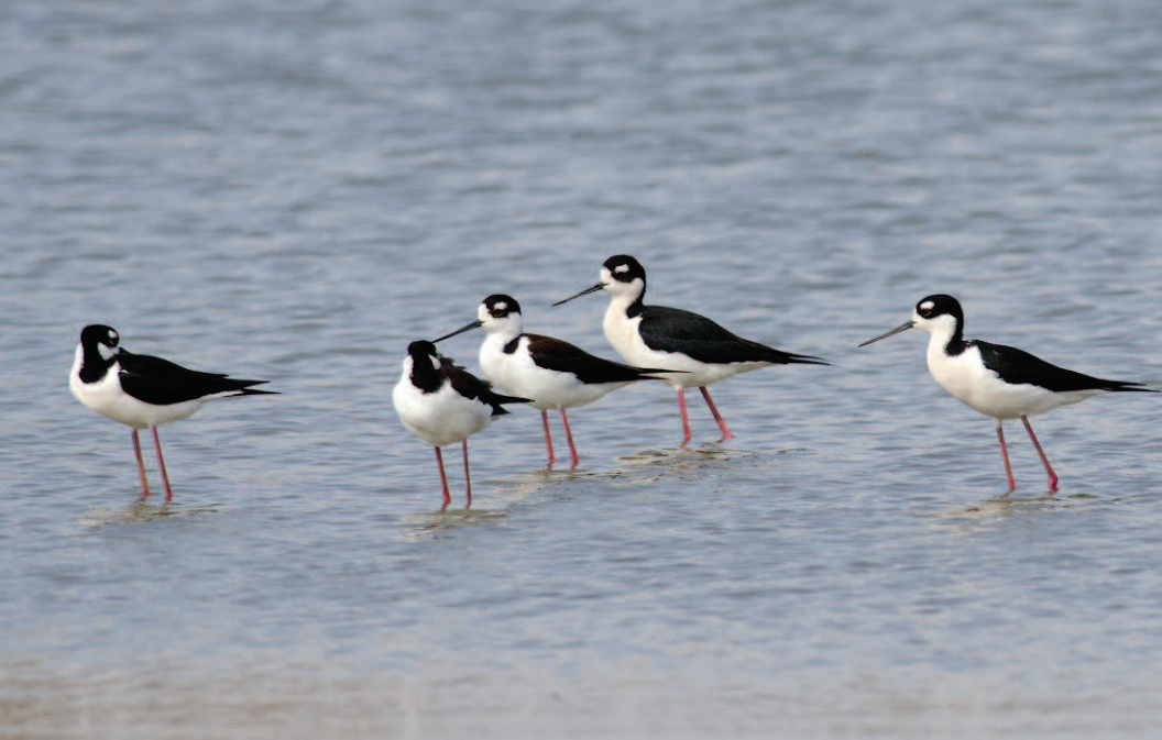
Figure 10. Black-necked Stilts at Windsor, Essex on 15 April 2017.