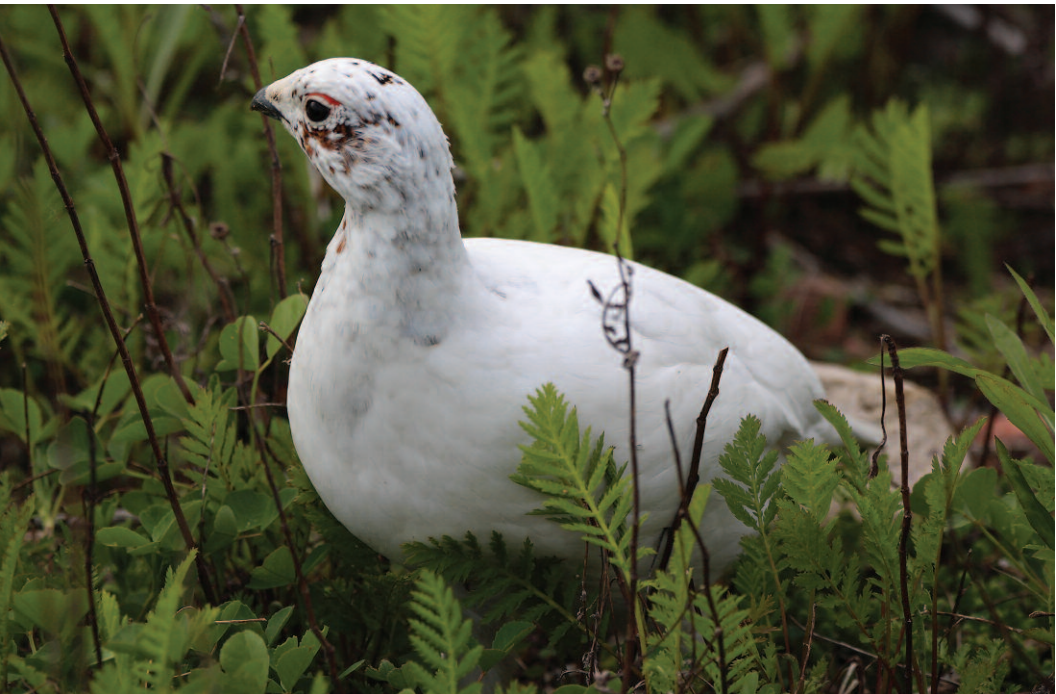
Figure 4. Willow Ptarmigan at Toronto (Tommy Thompson Park), Toronto on 13 May 2017.