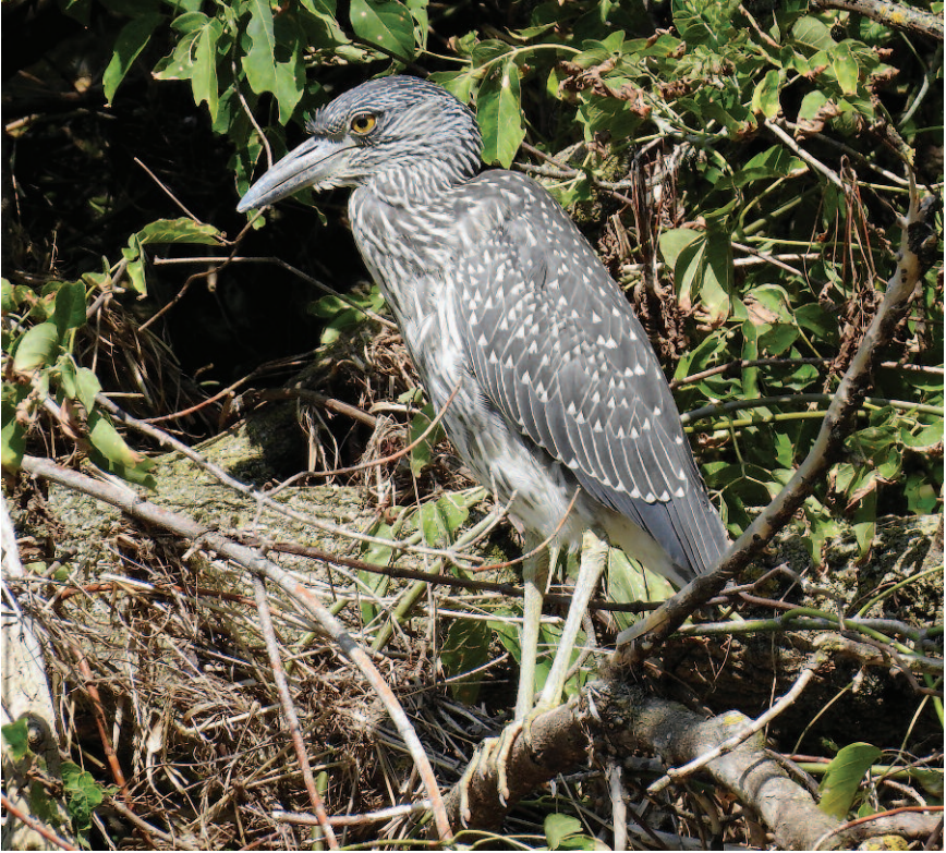
Figure 8. Yellow-crowned Night-Heron at St. Jacobs, Waterloo on 2 September 2017.