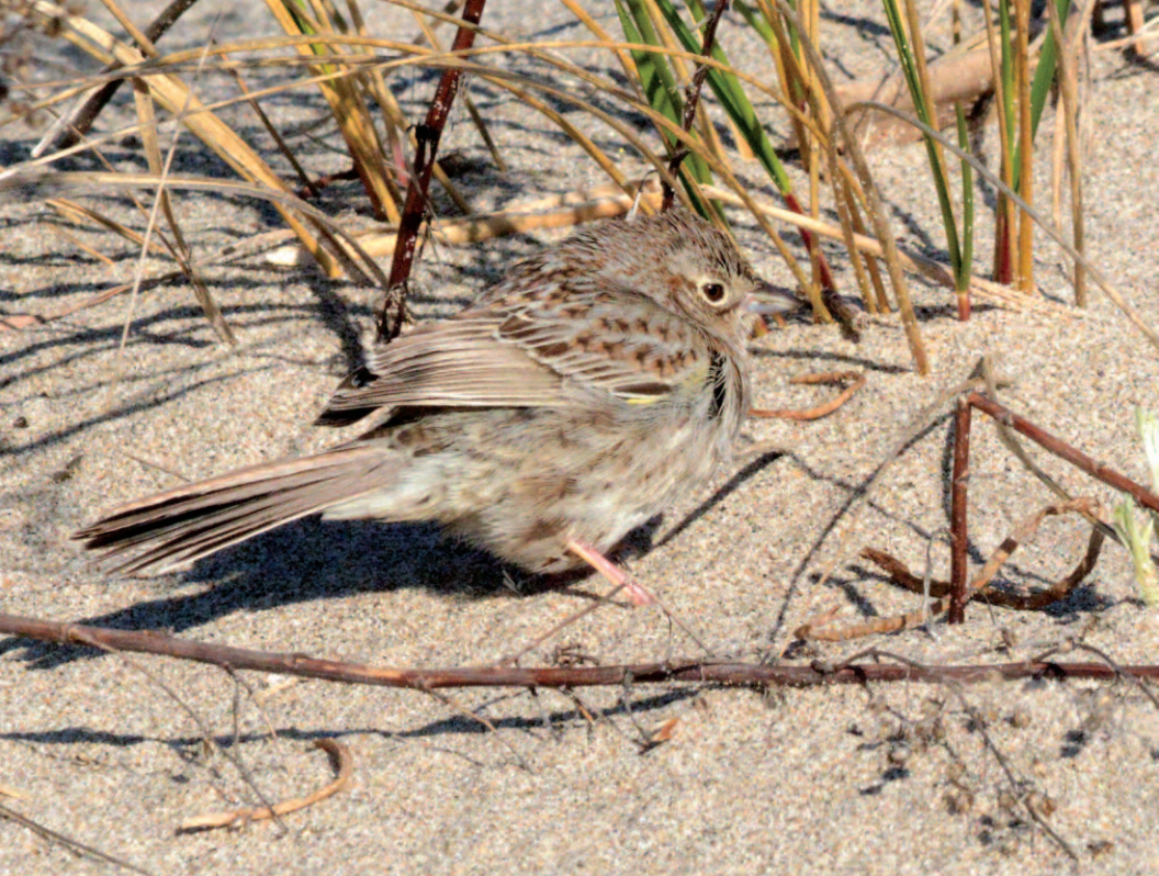
Figure 22. Cassin's Sparrow at Long Point (Tip), Norfolk on 24 April 2017.