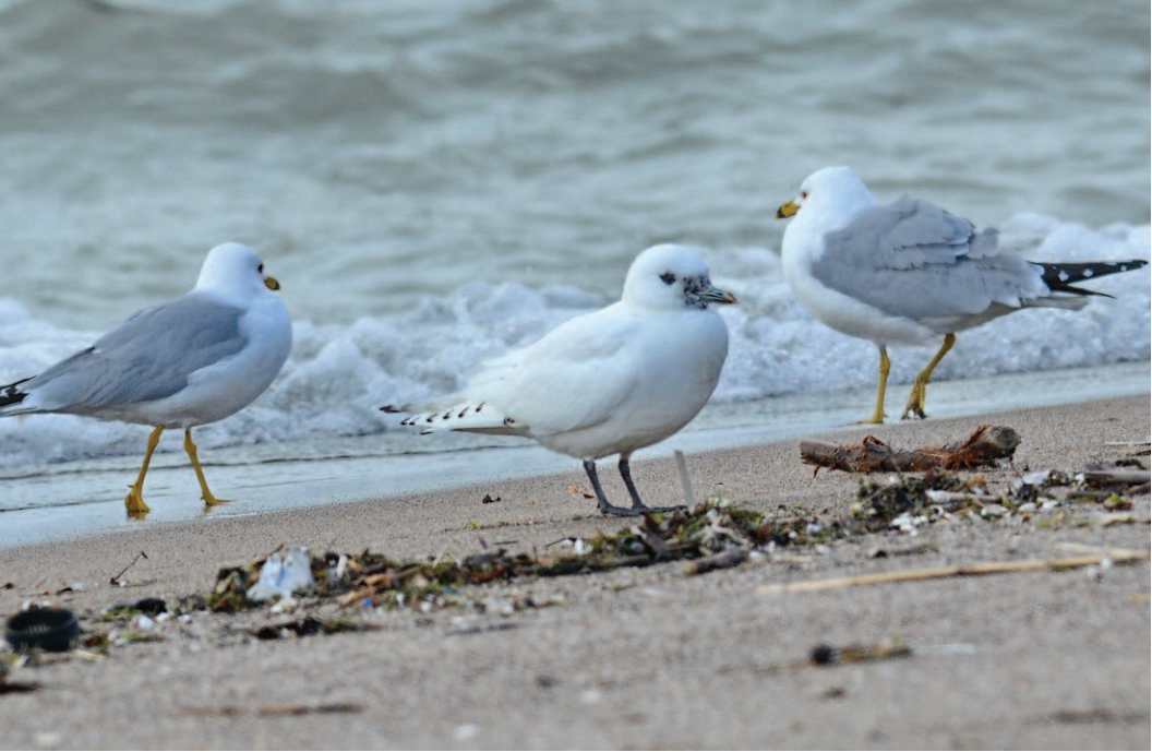
Figure 13. Ivory Gull with Ring-billed Gulls ( Larus delawarensis ) at Colchester, Essex on 3 March 2017.