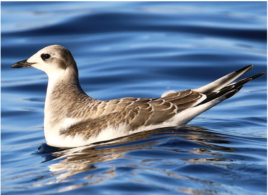
Figure 14. Sabine's Gull at Bedivere Lake, Thunder Bay on 22 September 2017.