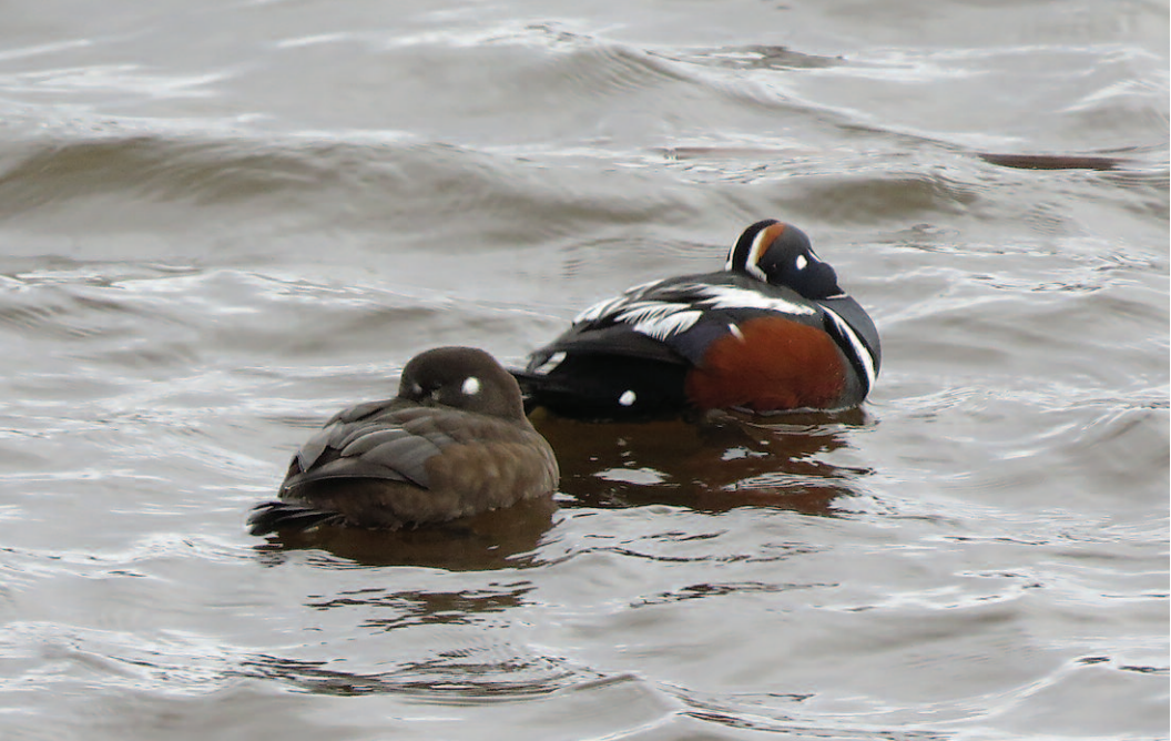
Figure 3. Harlequin Ducks at Connaught, Cochrane on 28 April 2017.