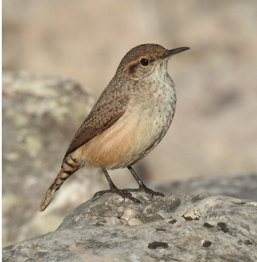
Figure 19. Rock Wren at Boulder Beach, Bruce on 8 October 2017.