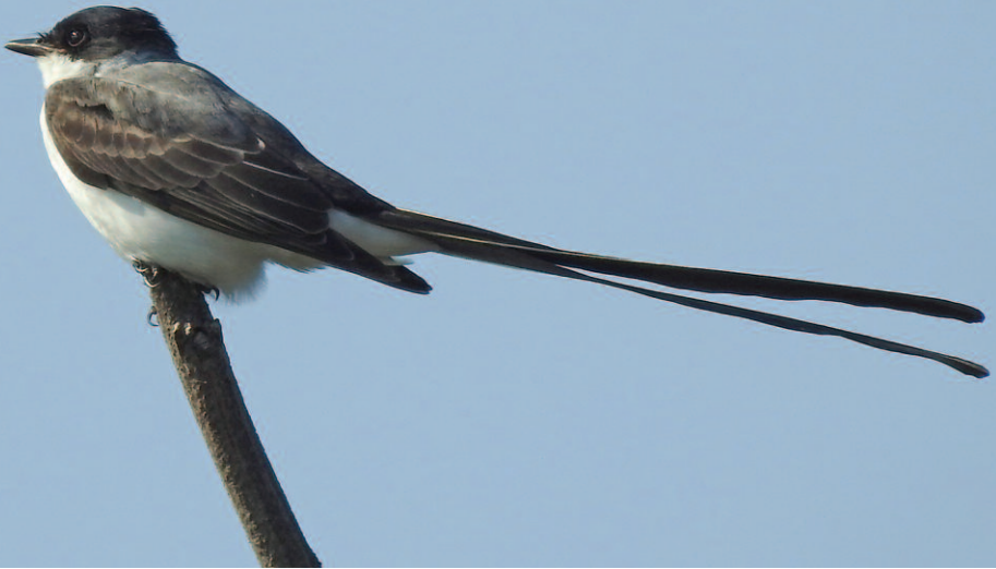
Figure 17. Fork-tailed Flycatcher at Toronto (Tommy Thompson Park), Toronto on 24 September 2017.