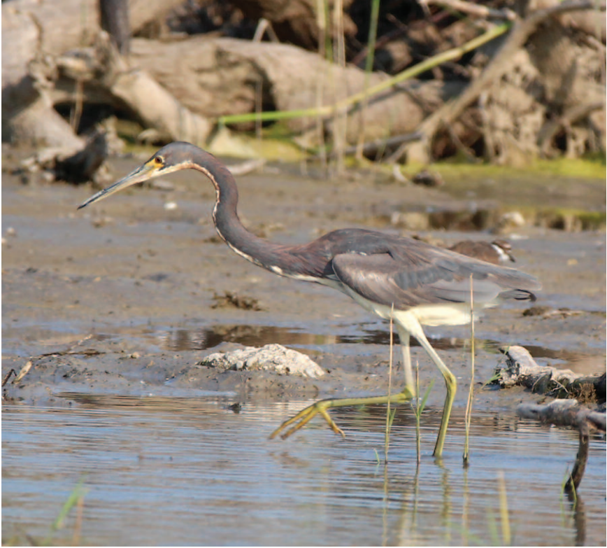
Figure 7. Tricolored Heron at Toronto (Tommy Thompson Park), Toronto on 21 July 2017.