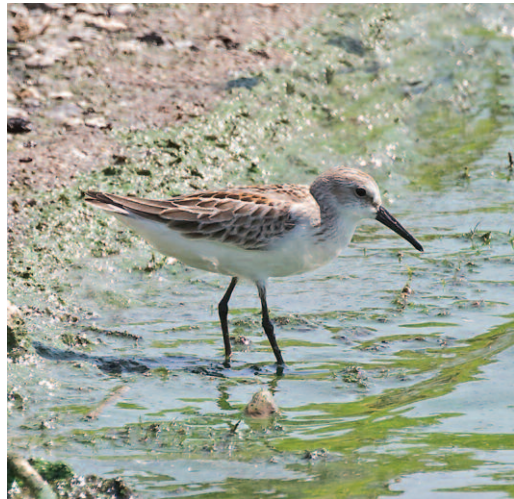
Figure 12. Right: Western Sandpiper at Blenheim, Chatham-Kent on 20 August 2017.