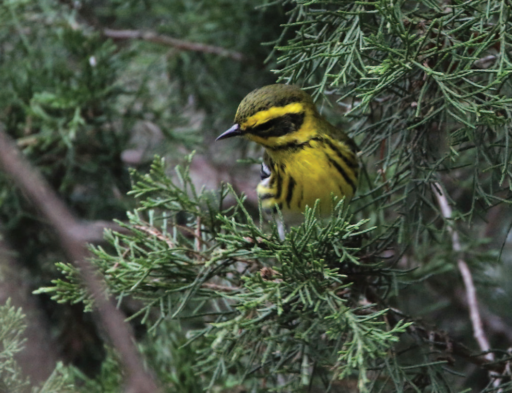
Figure 21. Townsend's Warbler at Rondeau Park, Chatham-Kent on 22 November 2017.