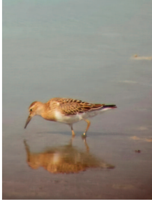
Figure 11. Upper right: Sharp-tailed Sandpiper at Exeter, Huron on 3 September 2017.