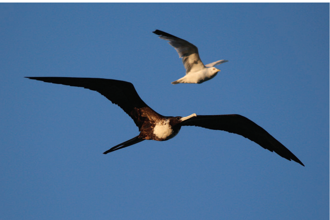
Figure 6. Magnificent Frigatebird at Sturgeon Creek (mouth), Essex on 2 July 2017.