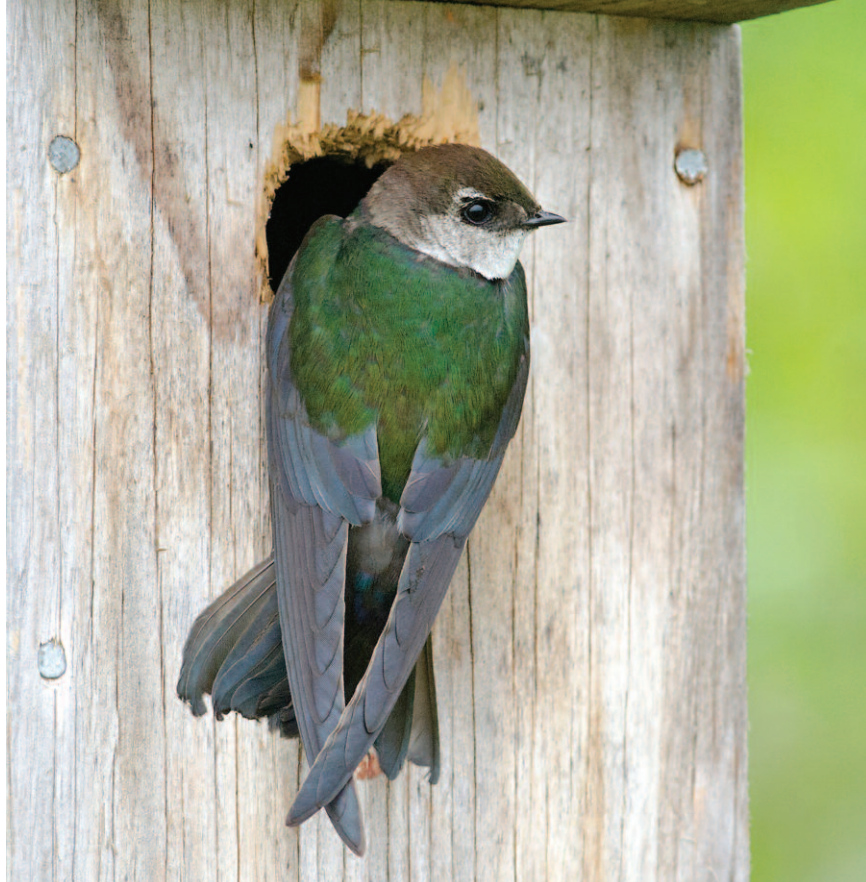
Figure 18. Violet-green Swallow at Thunder Bay, Thunder Bay on 14 June 2017.