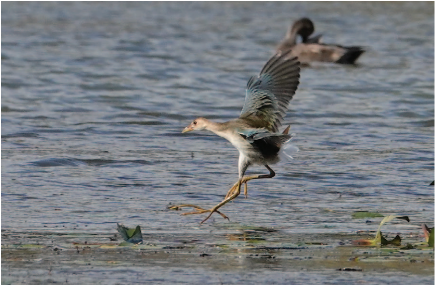
Figure 4. Purple Gallinule at Tommy Thompson Park, Toronto on 17 October 2021.