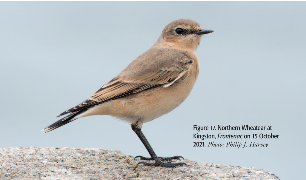
Figure 17. Northern Wheatear at Kingston, Frontenac on 15 October 2021.

With four records, 2021 ties 1990 for the most records in a single year.