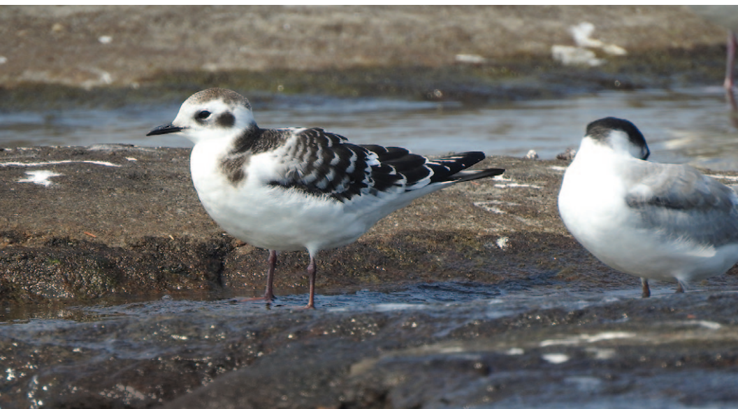
Figure 7. Juvenile Little Gull with Common Tern ( Sterna hirundo ) at Fushimi Lake, Cochrane on 20 August 2021.