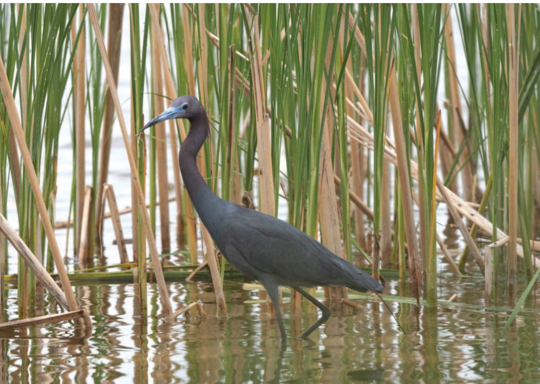
Figure 9. Little Blue Heron at Kingston, Frontenac on 4 June 2021.