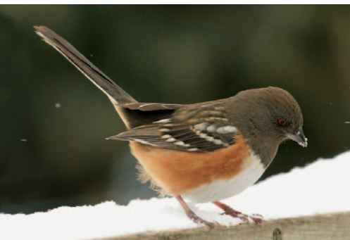
Figure 20. Spotted Towhee at London, Middlesex in February 2021.