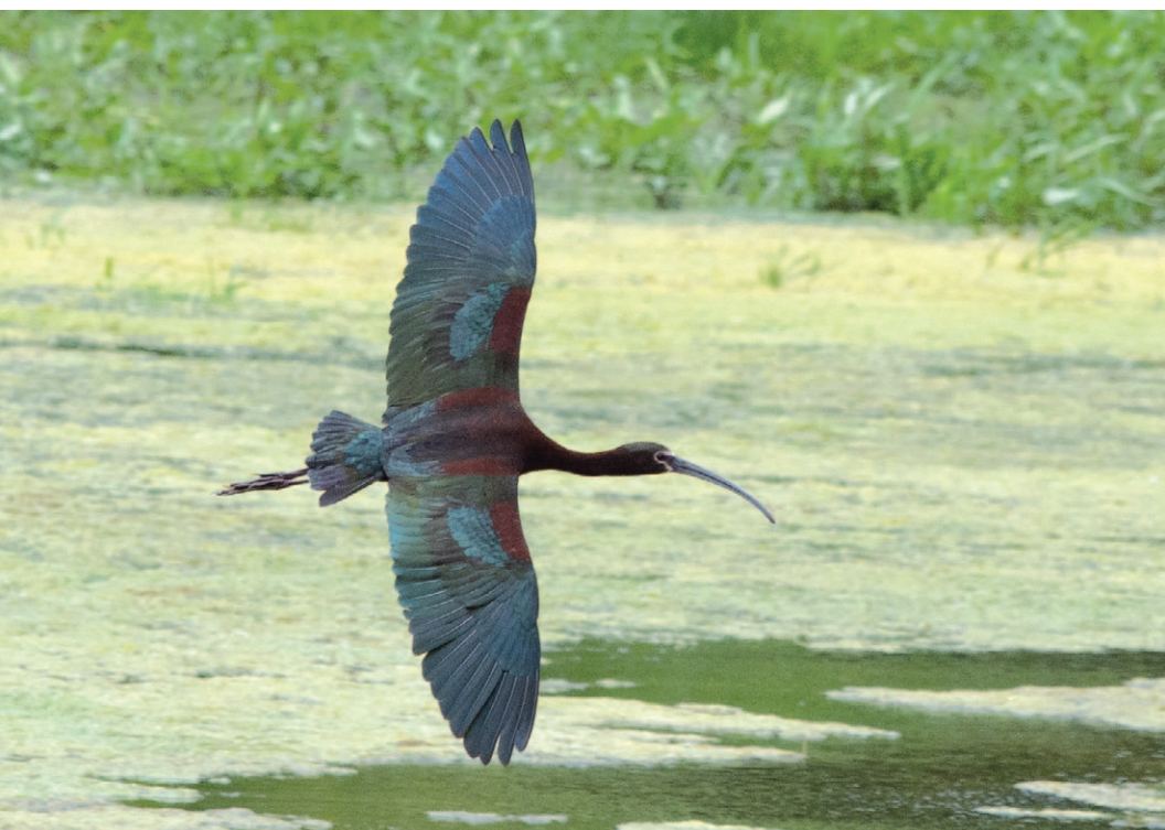
Figure 10. White-faced Ibis at Conestogo, Waterloo on 24 June 2021.