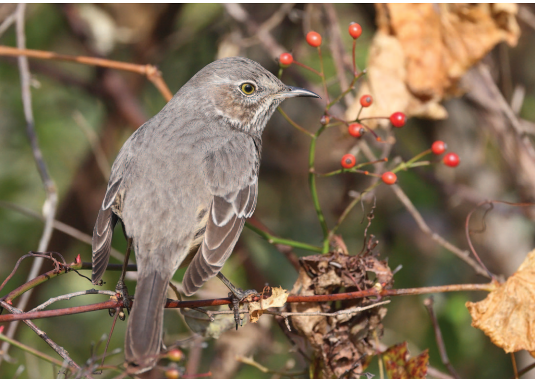
Figure 16. Sage Thrasher at Mitchell's Bay, Chatham-Kent on 10 November 2021.