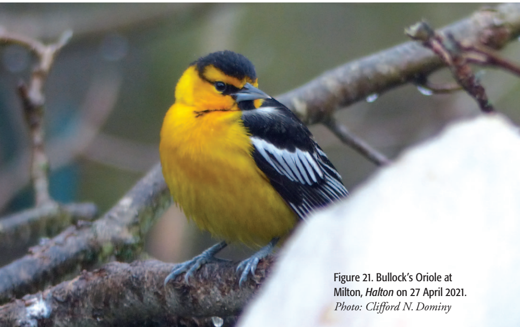
Figure 21. Bullock's Oriole at Milton, Halton on 27 April 2021.