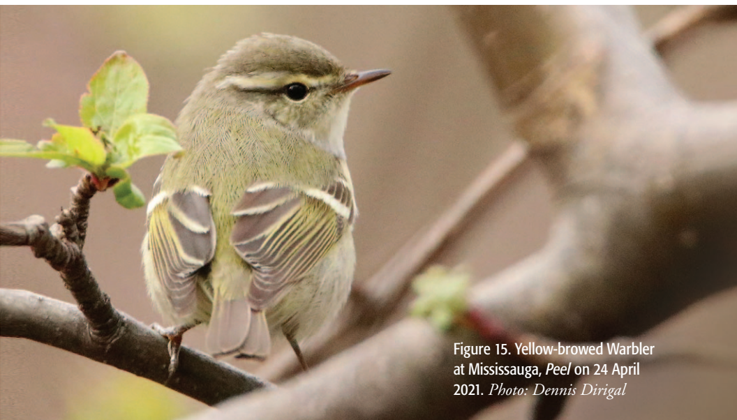
Figure 15. Yellow-browed Warbler at Mississauga, Peel on 24 April 2021.