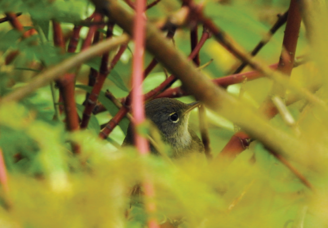
Figure 22. MacGillivray's Warbler at Tommy Thompson Park, Toronto on 5 October 2021.