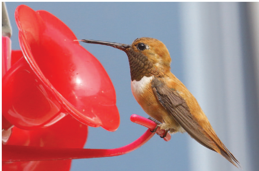
Figure 3. Rufous Hummingbird at Renwick, Chatham-Kent on 20 September 2021.