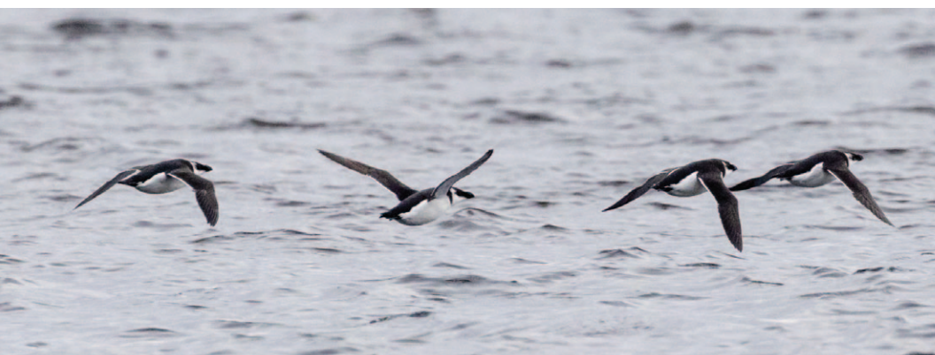
Figure 6. A group of four Razorbills at Shirleys Bay, Ottawa on 11 October 2021.