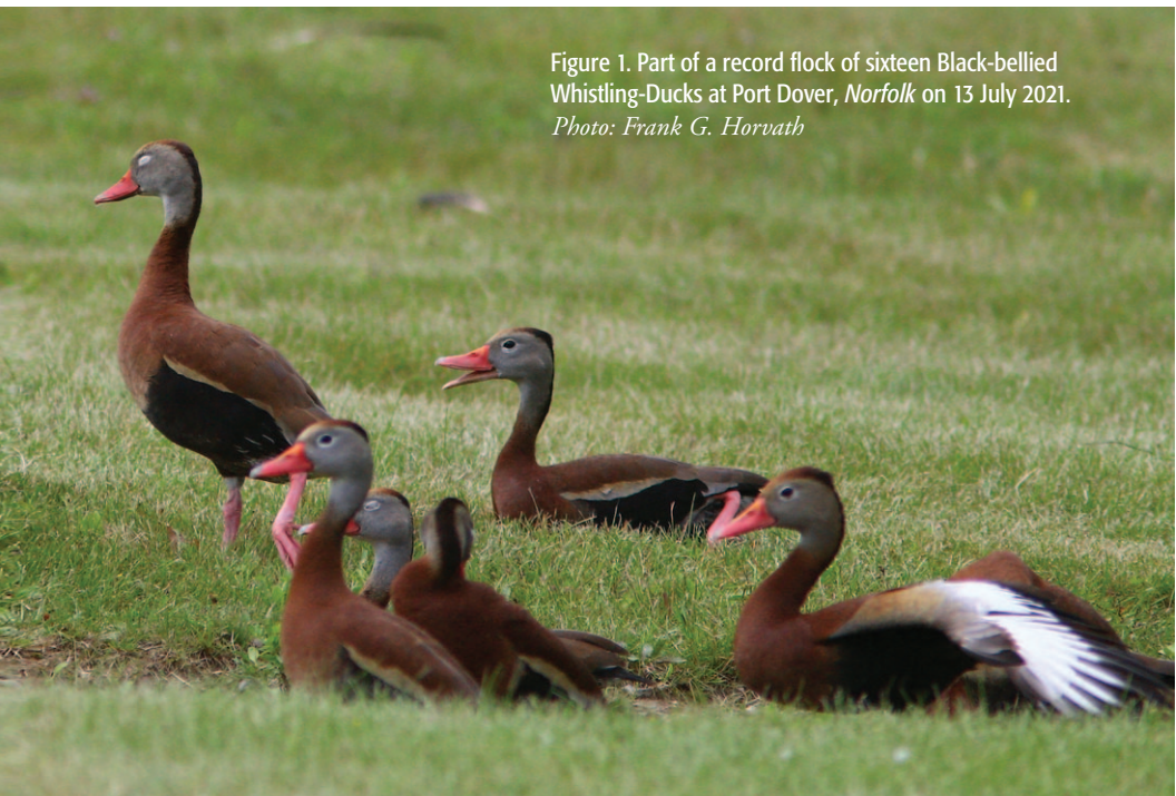
Figure 1. Part of a record flock of sixteen Black-bellied Whistling-Ducks at Port Dover, Norfolk on 13 July 2021.