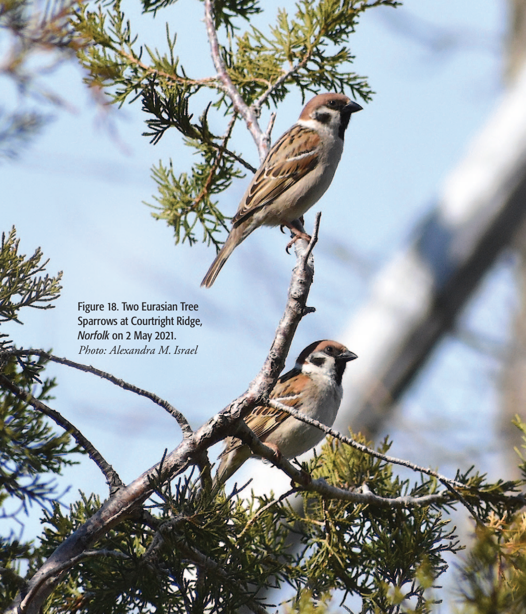
Figure 18. Two Eurasian Tree Sparrows at Courtright Ridge, Norfolk on 2 May 2021.