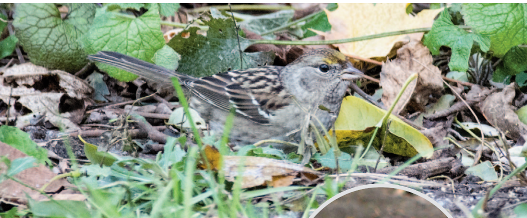
Figure 19. This Golden-crowned Sparrow arrived in Scarborough, Toronto in formative plumage (above; 23 November 2021. ) but had molted into first alternate “breeding” plumage by the time it departed (right; 20 April 2022. ).