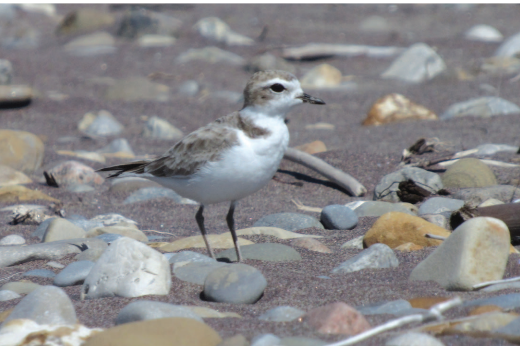
Figure 5. Snowy Plover at Hastings Drive, Norfolk on 7 September 2021.