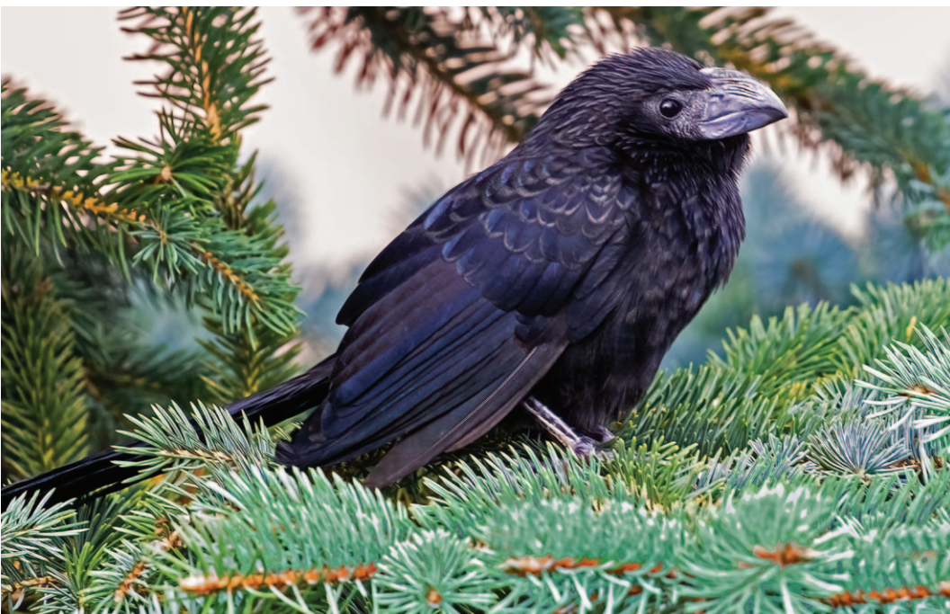
Figure 2. Groove-billed Ani at Brocksden, Perth on 26 October 2021.