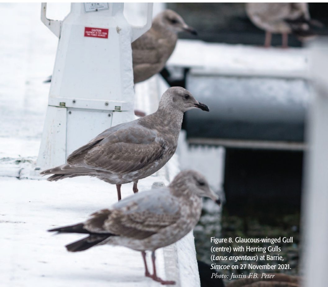
Figure 8. Glaucous-winged Gull (centre) with Herring Gulls ( Larus argentatus ) at Barrie, Simcoe on 27 November 2021.