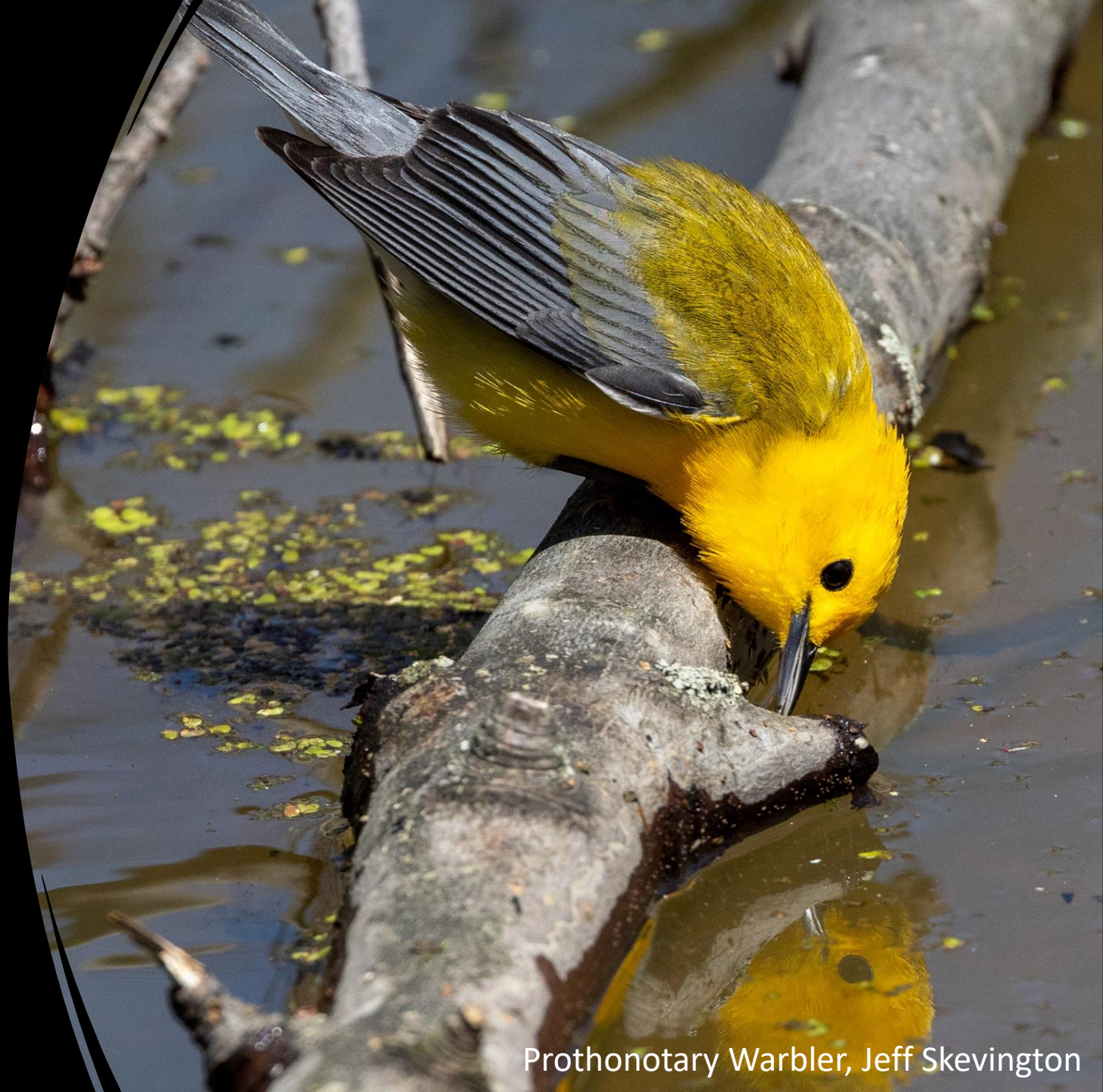
Prothonotary Warbler

We are grateful to this year's recipients for their contributions and achievements.