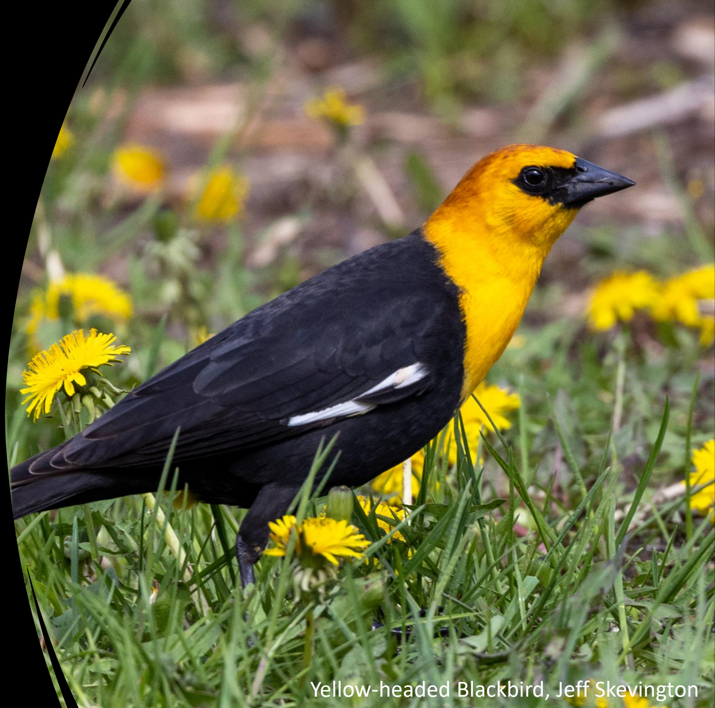
Yellow-headed Blackbird, Jeff Skevington