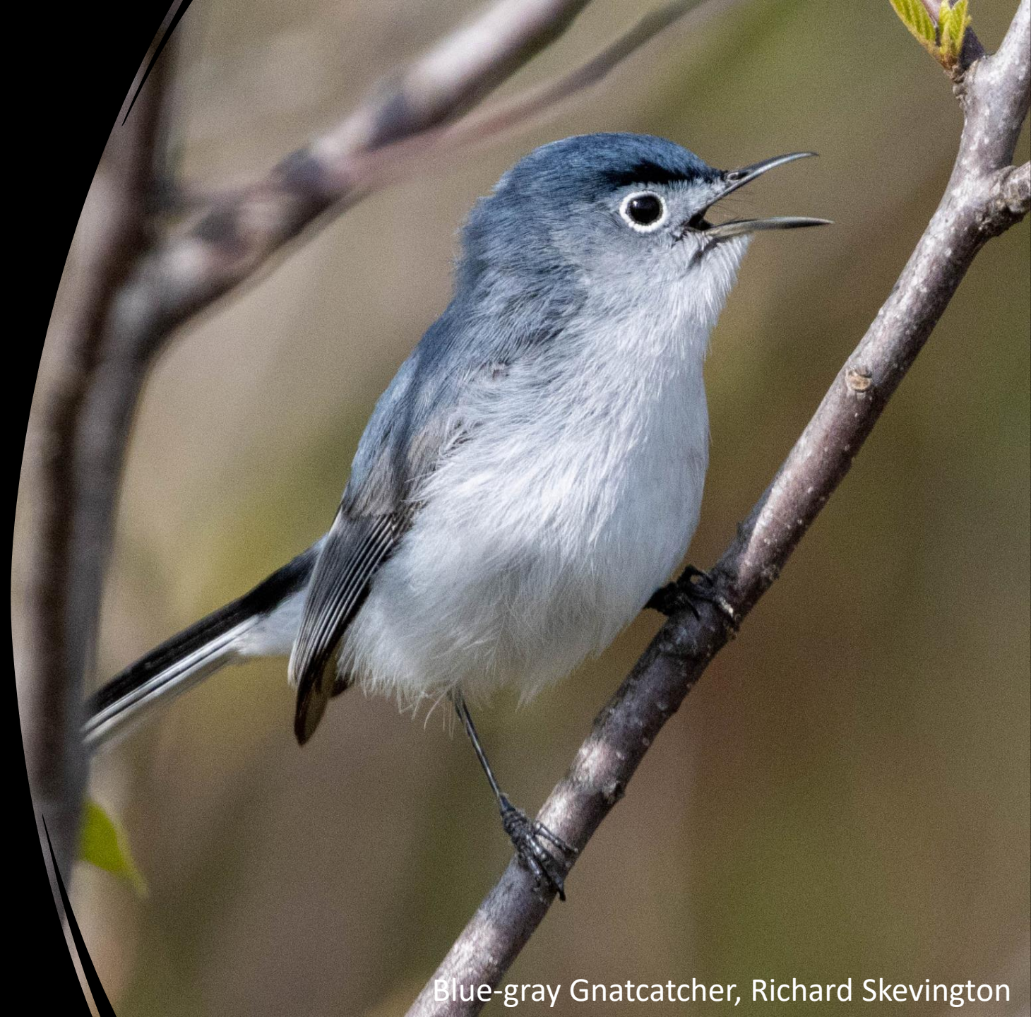
Blue-gray Gnatcatcher