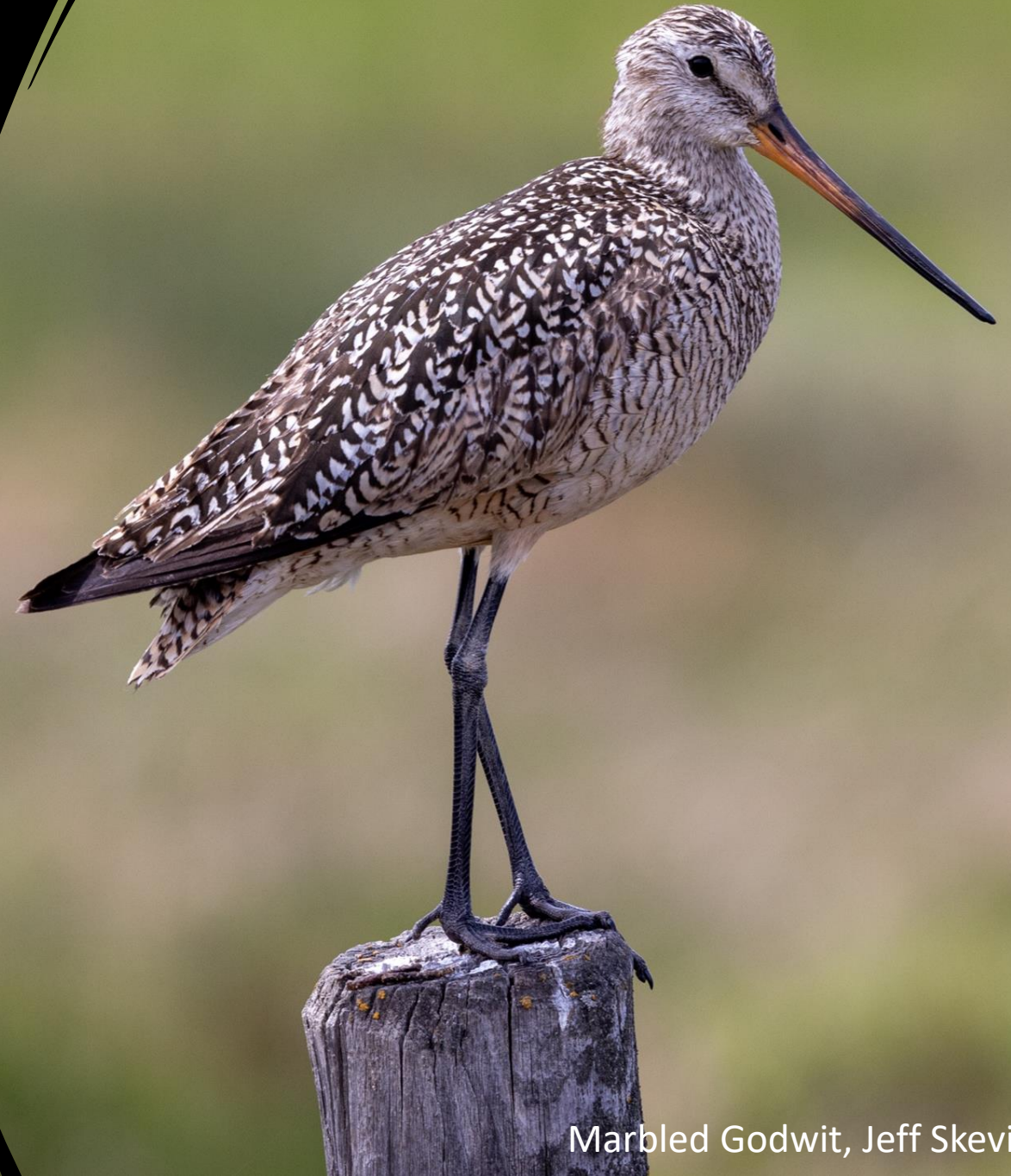
Marbled Godwit