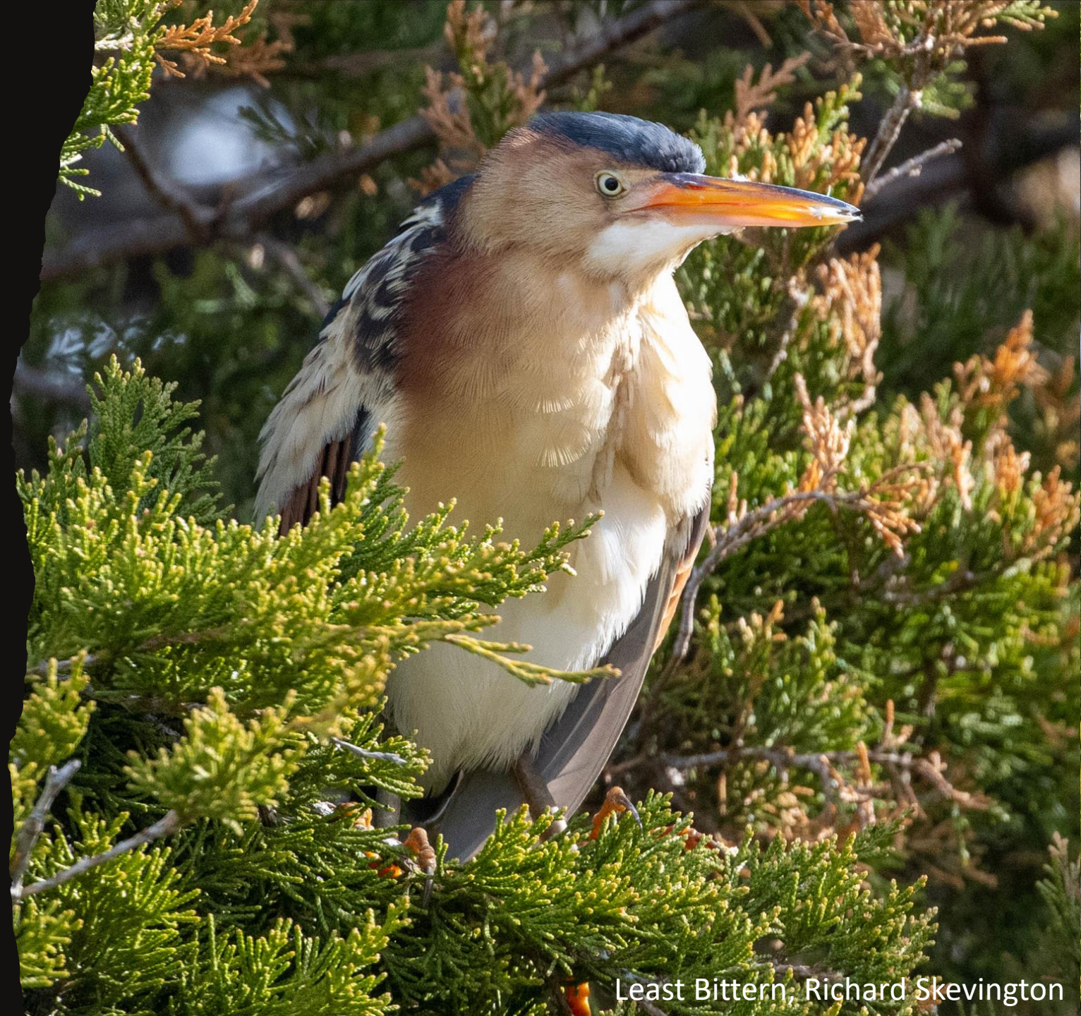
Least Bittern

Thanks to our members for keeping our society strong!