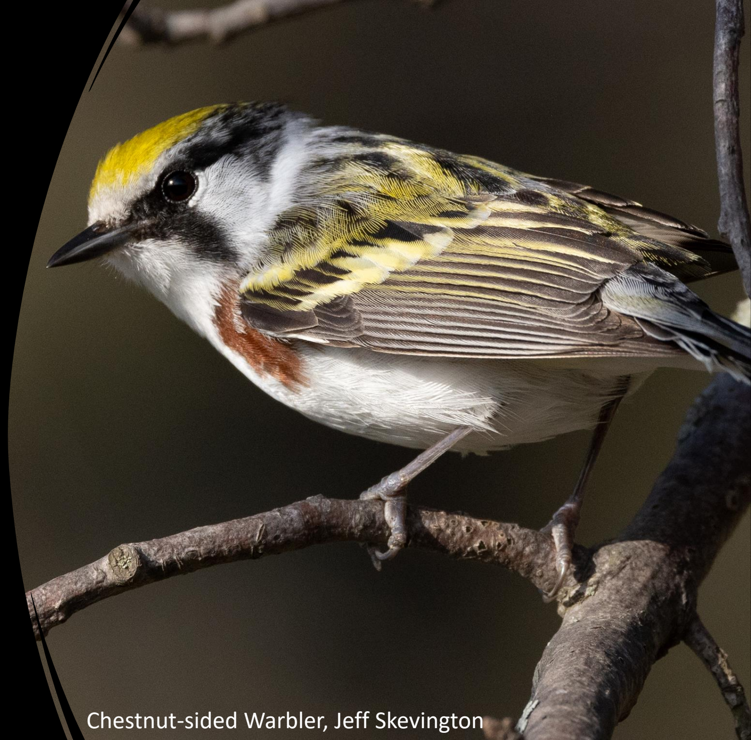
Chestnut-sided Warbler, Jeff Skevington