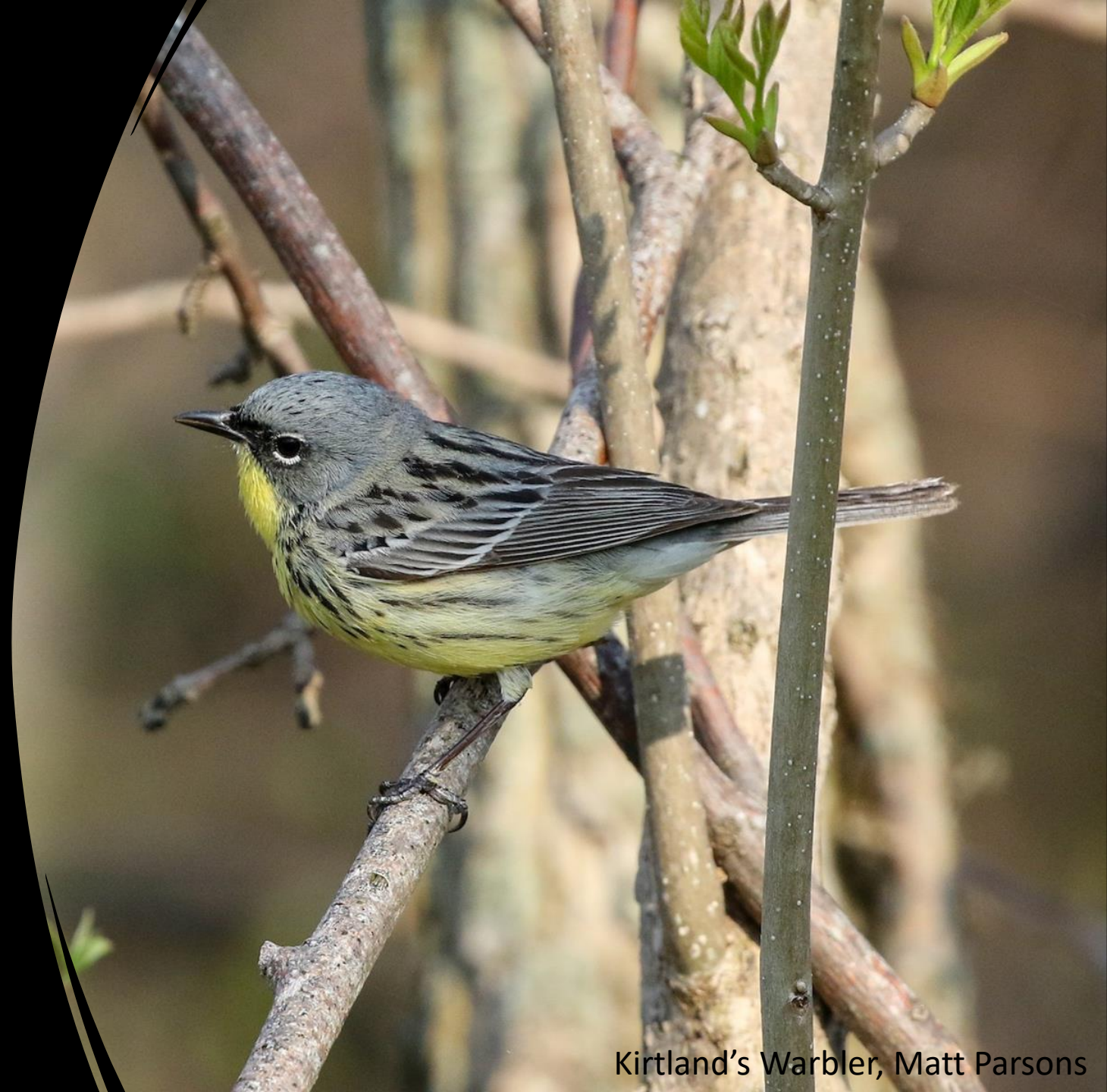
Kirtland's Warbler, Matt Parsons