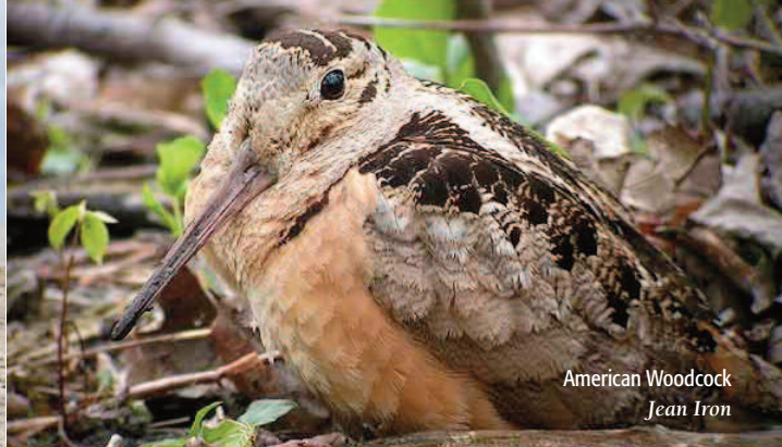
American Woodcock

Note that the field trip schedule may be adjusted. Please confirm the field trip agenda at www.ofo.ca prior to the convention.