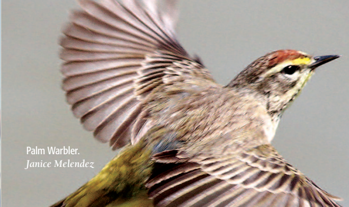
Palm Warbler.

Please check the OFO website for more information on field trips, speakers, trip leaders, events, field trip meeting location maps and directions.