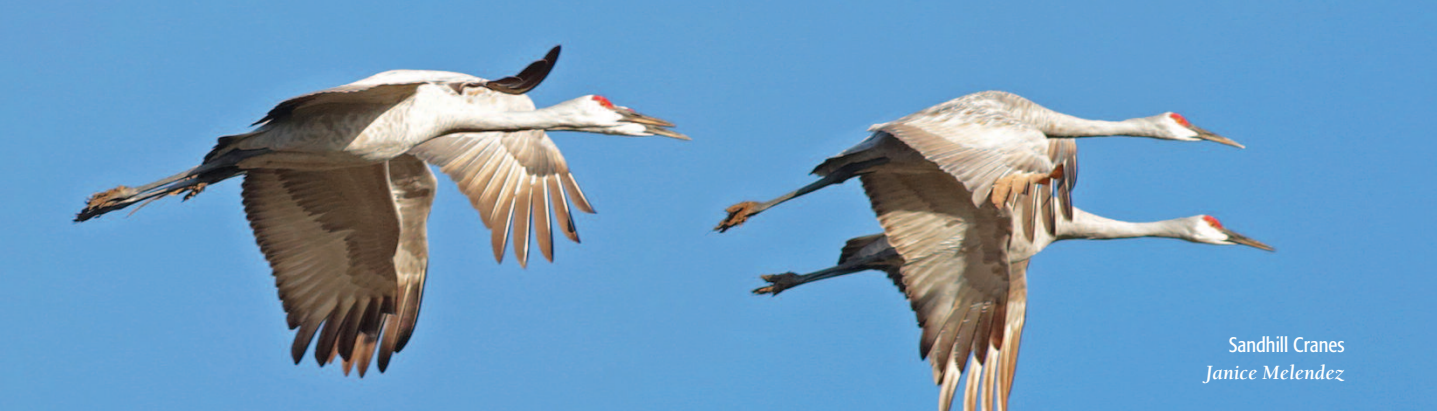
Sandhill Cranes Janice Melendez

*LPBT (Long Point Birding Trail) Number indicates birding guide/map number).