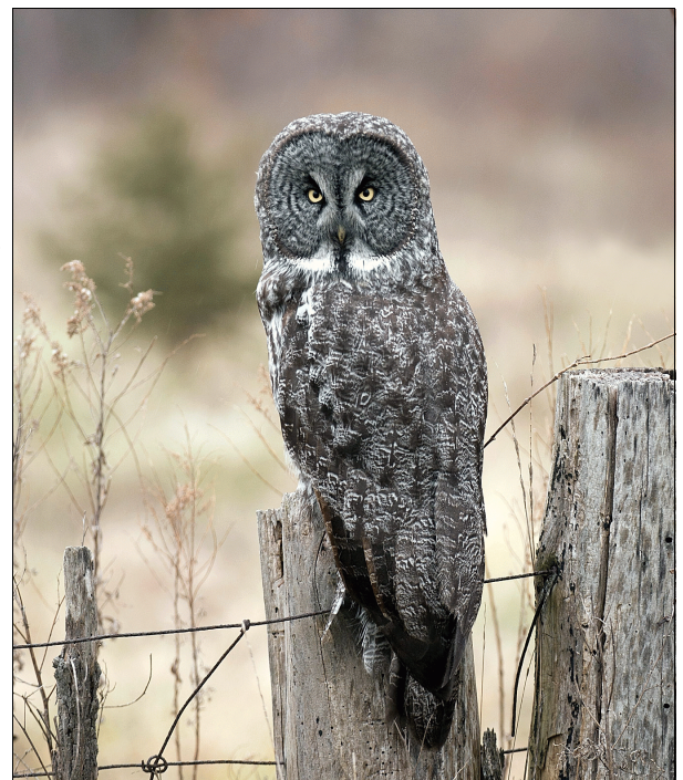
The famous Great Gray Owl that was at Kingsville, pictured here on December 30, 2011