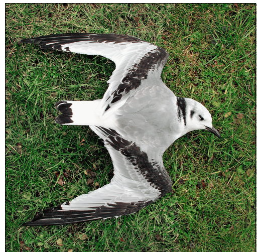
Immature Black-legged Kittiwake that was at Sturgeon Creek on December 27-29, 2011 — Alan Wormington.