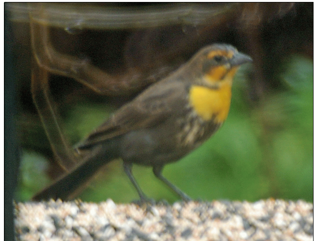
Female Yellow-headed Blackbird at SE Hillman Marsh on May 15, 2011