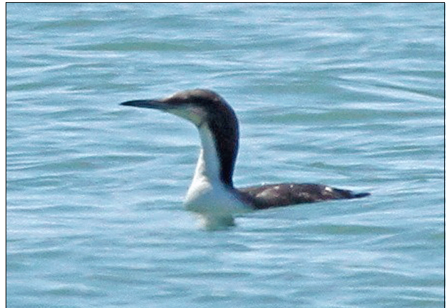
Immature Pacific Loon at Point Pelee on May 9-11, 2011