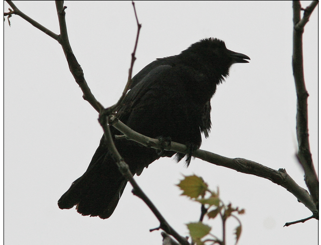
Fish Crow at the Visitor Centre on May 25, 2011