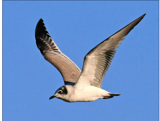
Immature Franklin's Gull at Sturgeon Creek on November 13–December 5, 2011 — Alan Wormington.

November 13–December 5 — one first-winter immature, Sturgeon Creek Marina (STP et al. )