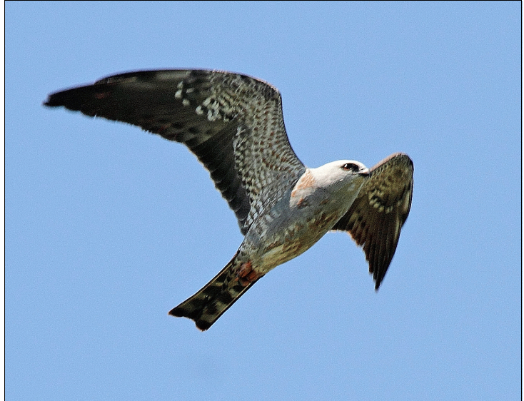
First-year immature Mississippi Kite at the west side of the Tip on May 24, 2011