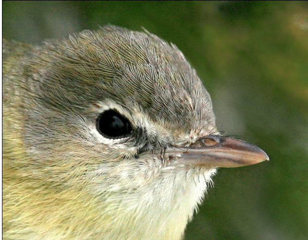
Bell's Vireo at the Tip on May 13, 2011