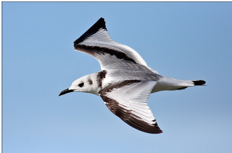
Immature Black-legged Kittiwake at the Tip on November 6, 2011 — Cherise A. Charron.

– unfortunately this bird died, and the specimen is now at the Royal Ontario Museum (Toronto).