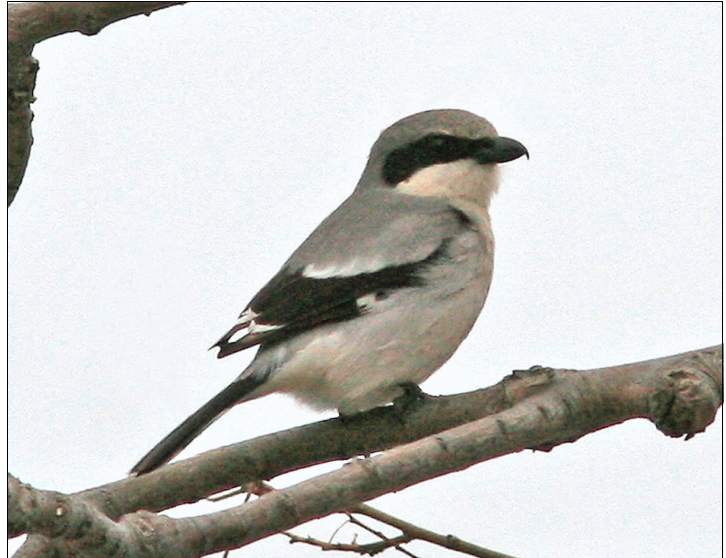
Loggerhead Shrike at the Tip on April 11, 2011 — Alan Wormington.

April 24 — one, east side of Tip (Paul D. Pratt)