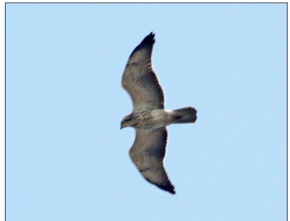
Juvenile Swainson's Hawk over the Visitor Centre on May 7, 2011