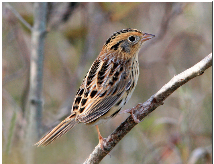
Le Conte’s Sparrow at the Sparrow Field on October 22-23, 2011 — Alan Wormington.

October 22-23 — one, Sparrow Field (STP et al. )