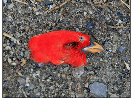
The head of a male Scarlet Tanager found at the Tip on April 18, 2014 — Alan Wormington