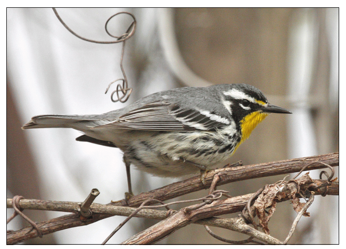
Yellow-throated Warbler (nominate dominica ?) at East Beach on May 10, 2014 — Bruce M. Di Labio