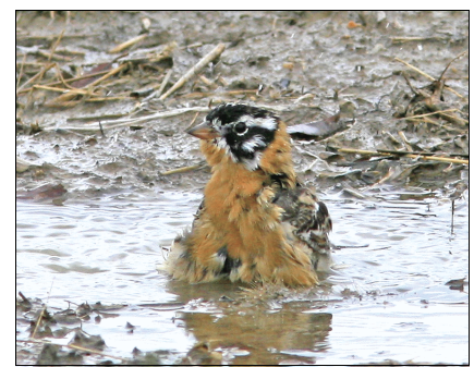
Male Smith's Longspur on April 29, 2014 — Alan Wormington