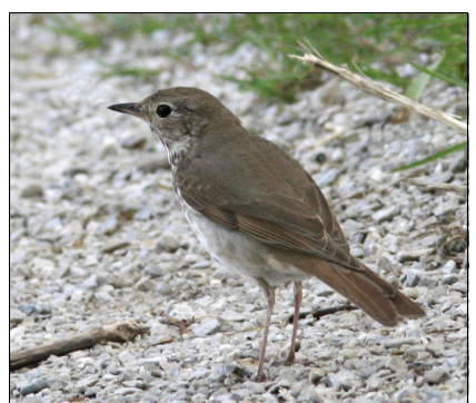
An apparent Bicknell's Thrush at the Tip on May 31, 2014 — Alan Wormington