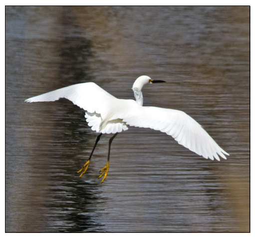
Adult Snowy Egret at NW Hillman Marsh on April 27, 2014