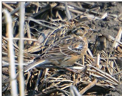
Female Smith's Longspur on May 3, 2014