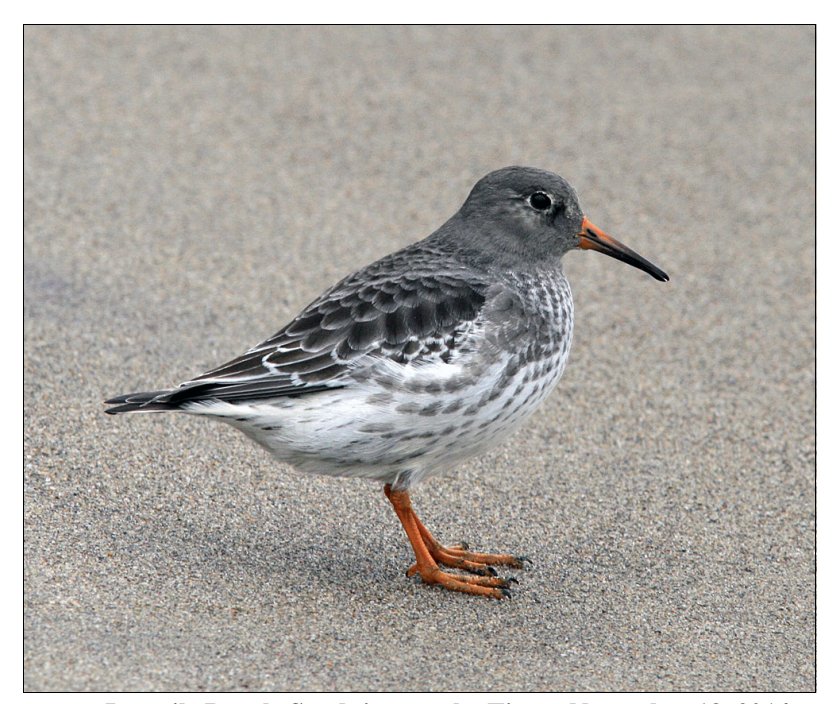
Juvenile Purple Sandpiper at the Tip on November 13, 2014 — Alan Wormington

November 8 — one, flying east to west past Tip (JLH, STP et al. ) November 13 — one juvenile, Tip (RPC et al. )