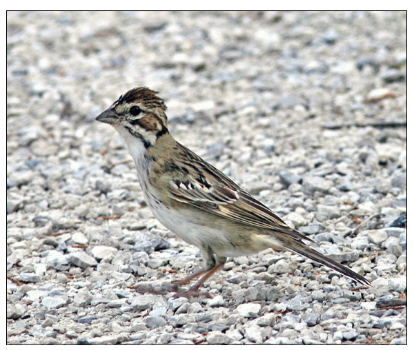
Immature Lark Sparrow at the west side of Tip, from August 22-24, 2014 — Alan Wormington