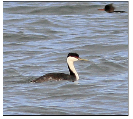
Western Grebe at the west side of the Tip on April 29-30, 2014 — Alan Wormington