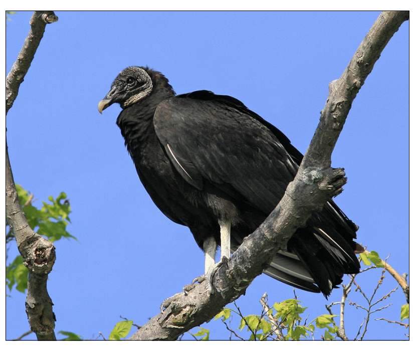
Black Vulture roosting at the Sparrow Field (with 44 Turkey Vultures nearby) on June 1, 2014 — Alan Wormington

May 9 — one dead (very fresh), Pelee Drive @ The Narrows (BRH et al. )