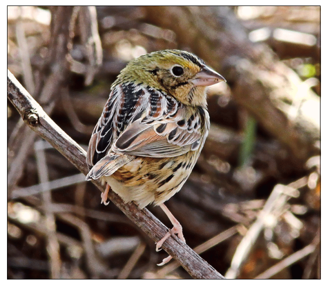
Henslow's Sparrow at DeLaurier Parking Area on April 17-18, 2014