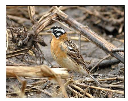
Male Smith's Longspur on April 29, 2014

a NEW species for Point Pelee — #393. This is an extremely rare species in southern Ontario, with just seven records in total; all previous records involved single birds only.