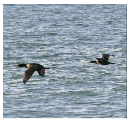
Neotropic Cormorant (right) at the Tip on June 1, 2014. Note the smaller head and body size, and thinner bill