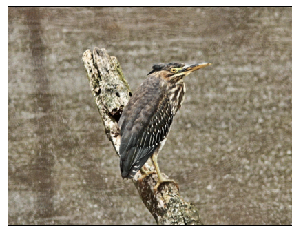
A record-late Green Heron on November 16, 2014, at Wheatley Provincial Park