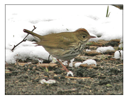
A record-early Ovenbird in the snow, at Sanctuary Picnic Area on April 15, 2014