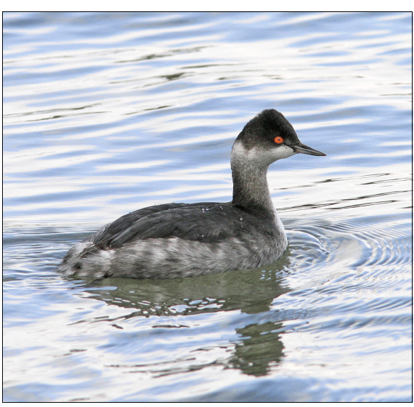
Adult Eared Grebe at Wheatley Harbour on November 17, 2014 — Alan Wormington

November 9-10 — one, east side of Tip (KGDB et al. )