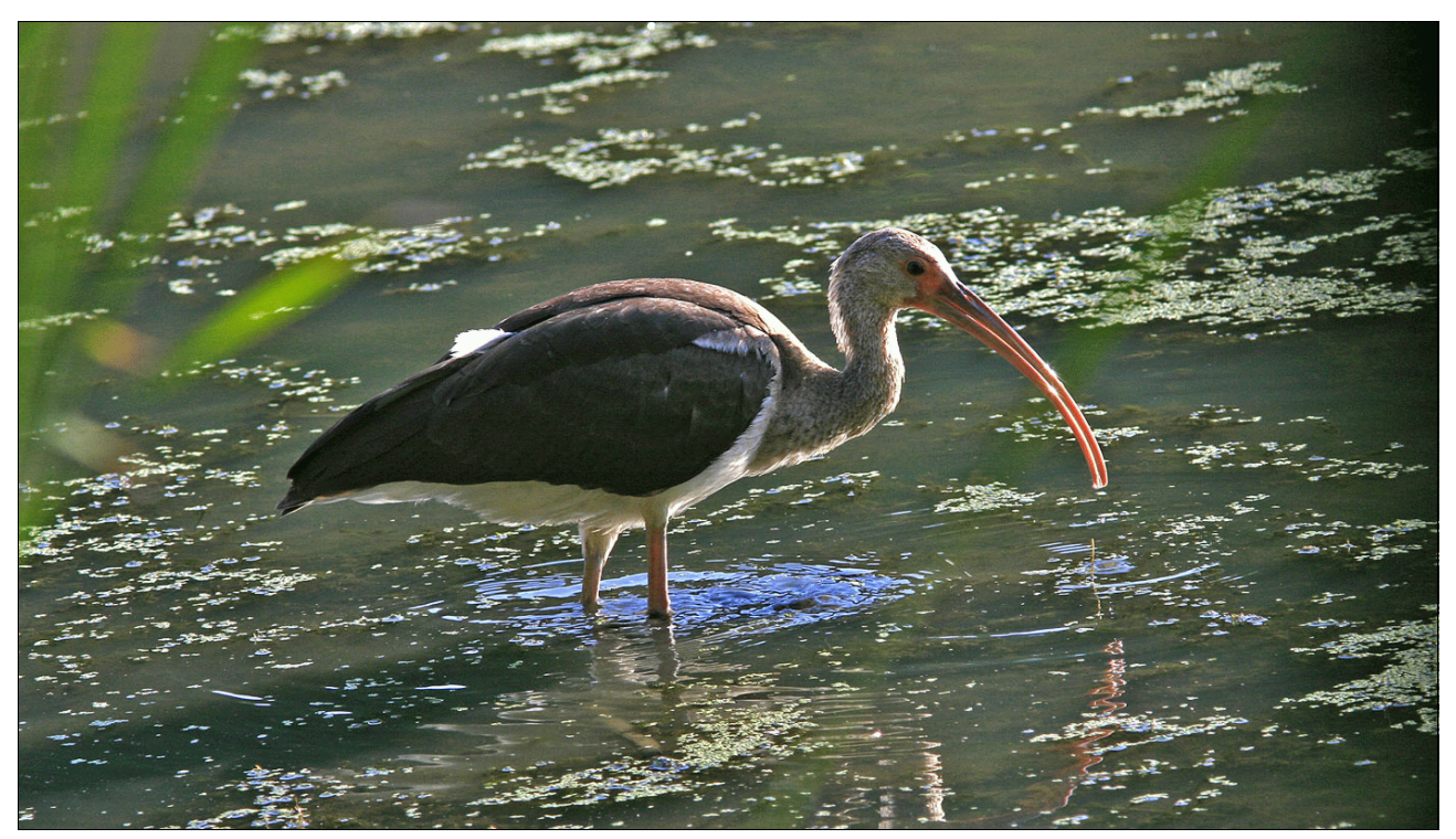
Establishing just the second record for the Point Pelee Birding Area, this juvenile White Ibis remained at Wheatley Provincial Park (Boosey Creek) from September 14-16, 2014 — Alan Wormington