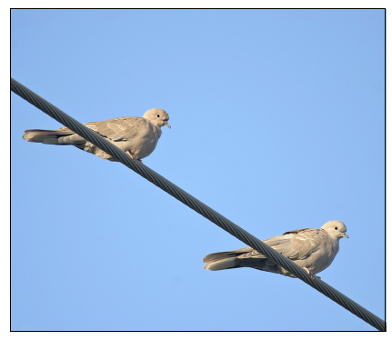
Two Eurasian Collared-Doves at Gore Hill on August 29, 2014